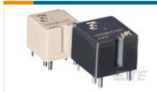
TE Part #1393280-6 V23086C1001A403