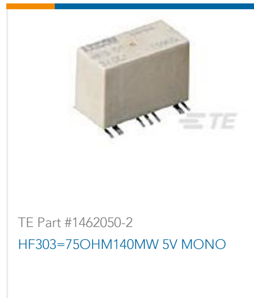
TE Part #1462050-2 HF303=75OHM140MW 5V MONO