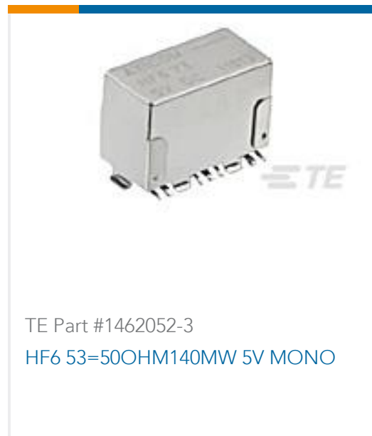
TE Part #1462052-3 HF6 53=50OHM140MW 5V MONO