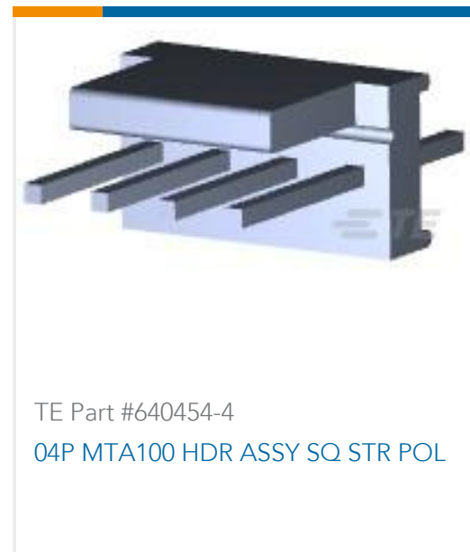
TE Part #640454-4 04P MTA100 HDR ASSY SQ STR POL