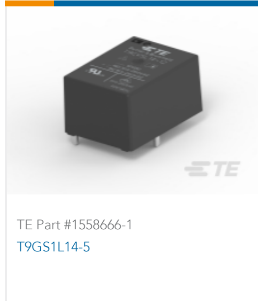
TE Part #1558666-1 T9GS1L14-5