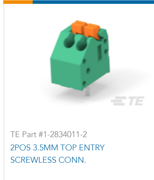
TE Part #1-2834011-2 2POS 3.5MM TOP ENTRY SCREWLESS CONN.