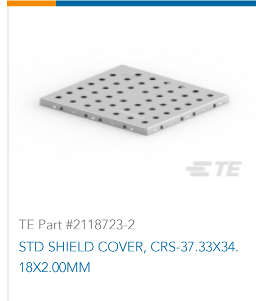
TE Part #2118723-2 STD SHIELD COVER, CRS-37.33X34.18X2.00MM