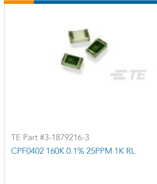
TE Part #3-1879216-3 CPF0402 160K 0.1% 25PPM 1K RL