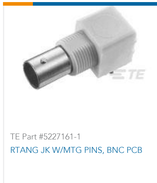
TE Part #5227161-1 RTANG JK W/MTG PINS, BNC PCB