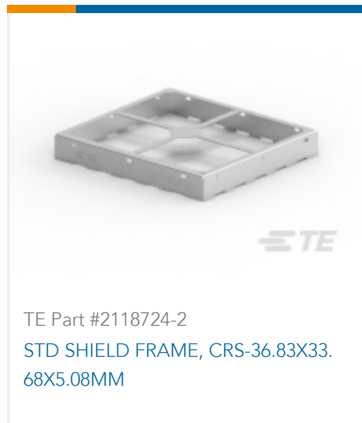
TE Part #2118724-2 STD SHIELD FRAME, CRS-36.83X33.68X5.08MM