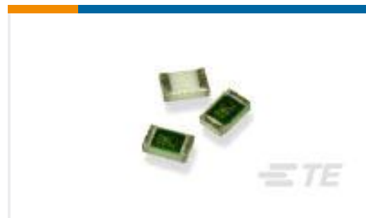
TE Part #5-1879214-9 CPF 0402 1K43 0.1% 25PPM 1K RL