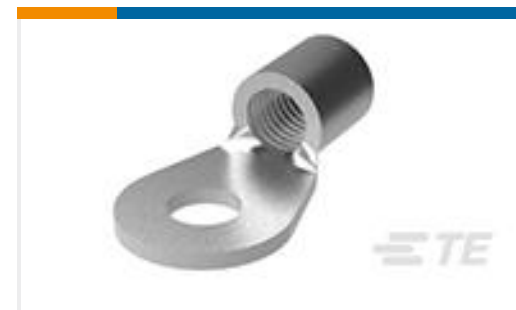
TE Part #2-33460-3 TERMINAL,SOLIS R 8 10