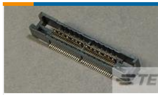
TE Part #5767054-2 MICT,RECPT,76,ASSY,PDNI