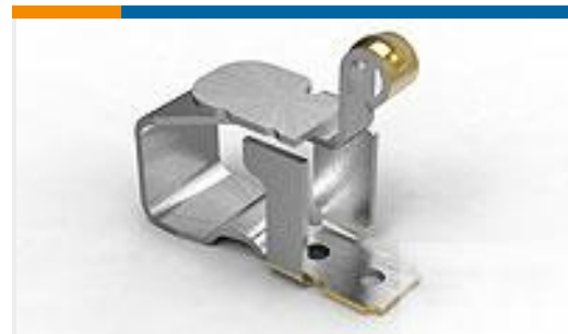
TE Part #1551575-5 Shield Finger, Loose Piece