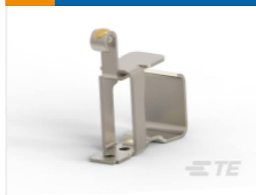
TE Part # 2388202-2 Shield Finger, 3.8mm