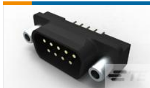
TE Part #5745071-2 HD-20 PLUG 9P VERT FFSCRLK