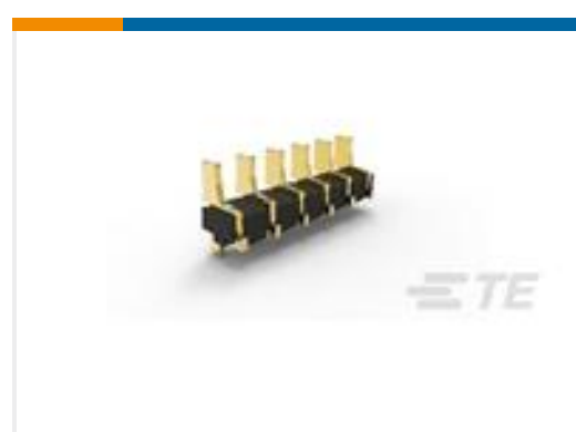
TE Part #1932870-2 FBIS-II PLUG ASSY 6 POS, 1.27um Gold