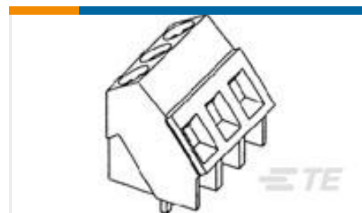
TE Part #796690-2 TERMI-BLOK PCB MOUNT 2P