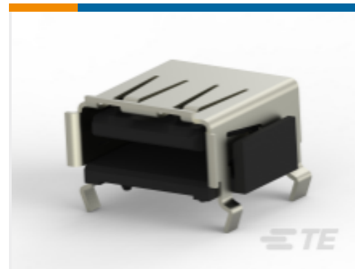
TE Part #1674459-4 Std USB Type A, R/A,T/H, Natural, HighDur