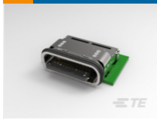
TE Part # 2305018-2 USB TYPE C, REC IPX8 ON BOARD DUAL SMT