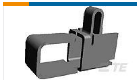
TE Part #1827625-1 SHIELD FINGER 3014 ANTI OVER STRESS TYPE