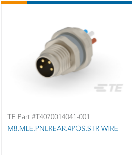
TE Part #T4070014041-001 M8.MLE.PNLREAR.4POS.STR WIRE