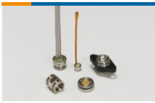
Media Isolated Pressure Sensors(87)