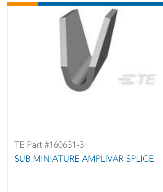
TE Part #160631-3 SUB MINIATURE AMPLIVAR SPLICE