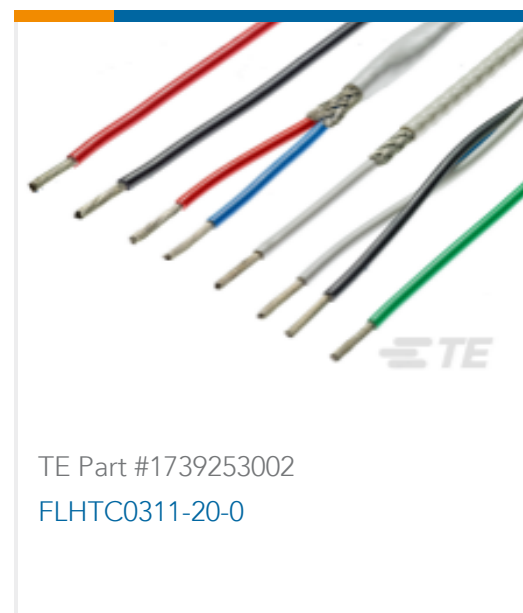
TE Part #1739253002 FLHTC0311-20-0