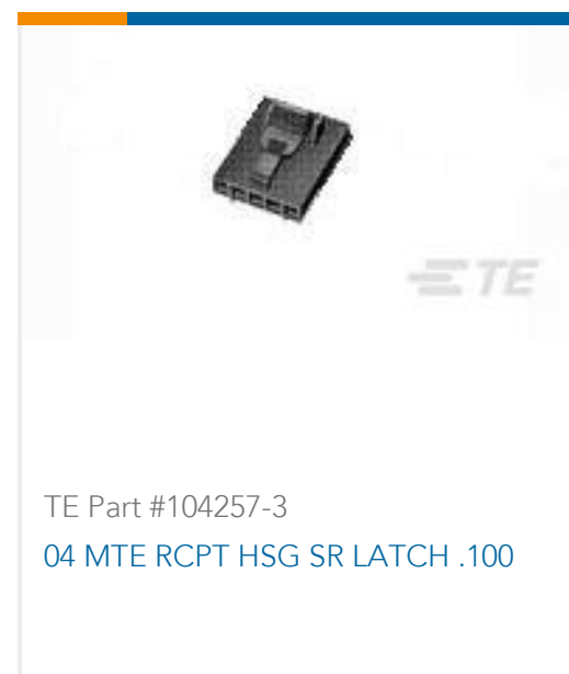
TE Part #104257-3 04 MTE RCPT HSG SR LATCH .100