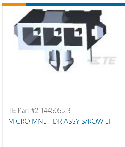
TE Part #2-1445055-3 MICRO MNL HDR ASSY S/ROW LF