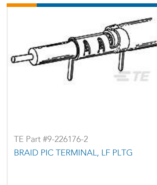
TE Part #9-226176-2 BRAID PIC TERMINAL, LF PLTG