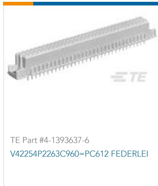
TE Part #4-1393637-6 V42254P2263C960=PC612 FEDERLEI