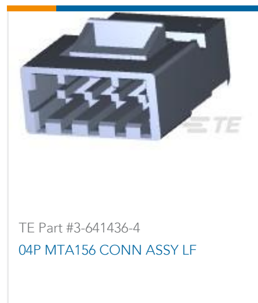
TE Part #3-641436-4 04P MTA156 CONN ASSY LF