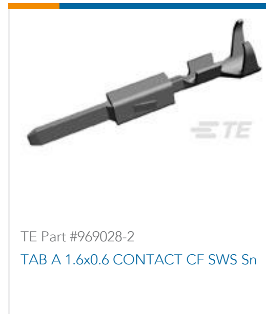
TE Part #969028-2 TAB A 1.6x0.6 CONTACT CF SWS Sn