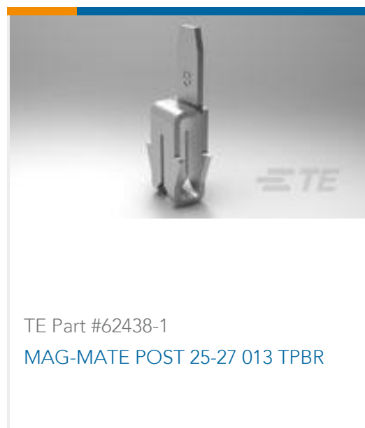
TE Part #62438-1 MAG-MATE POST 25-27 013 TPBR