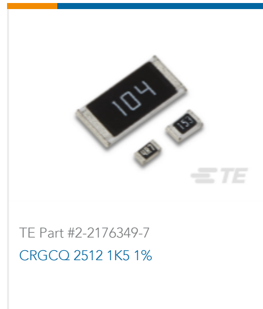
TE Part #2-2176349-7 CRGCO 2512 1K5 1%