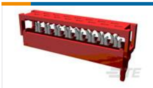
TE Part #215083-6 MICRO-MATCH MOW.06P