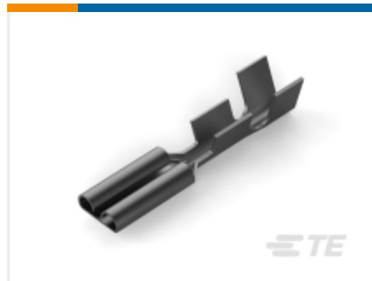
TE Part # 140719-2 110 FASTON, REC., 22-18 AWG, TPBR