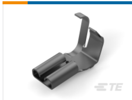
TE Part # 170141-2 187 FASTON, FLAG, REC., 20-16 AWG, TPBR