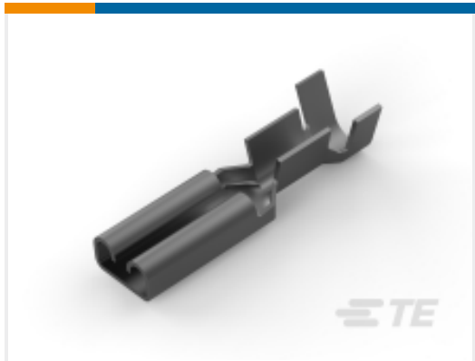
TE Part # 160626-2 110 FASTON, REC., 20-17 AWG, TPBR