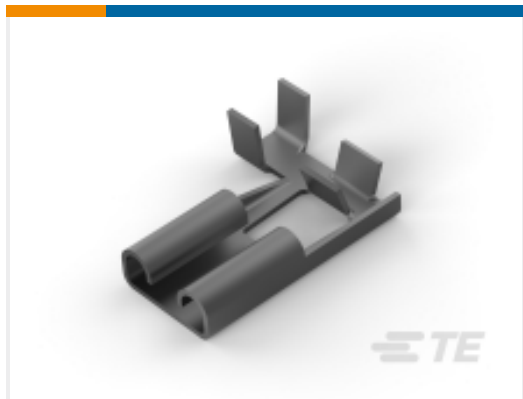
TE Part # 180430-2 250 FASTON, FLAG, REC., 20-16 AWG, TPBR