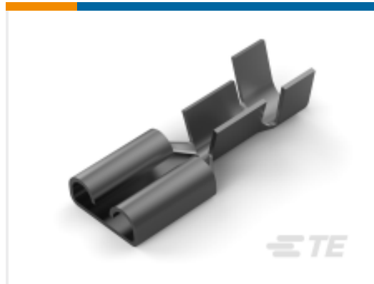
TE Part # 1-160304-2 250 FASTON, REC., 14-17 AWG, TPBR