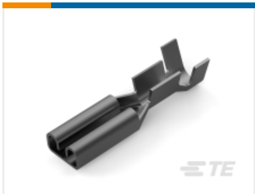
TE Part # 160625-2 110 FASTON, REC., 20-17 AWG, TPBR