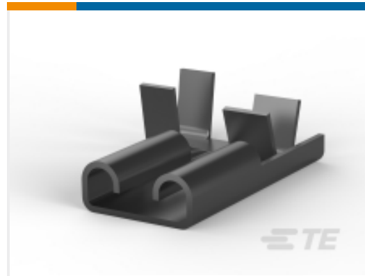
TE Part # 180429-2 250 FASTON, FLAG, REC., 17-14 AWG, TPBR