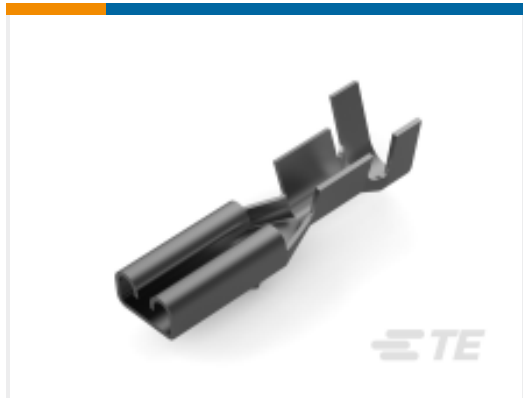
TE Part # 160668-2 110 FASTON, REC., 20-16 AWG, TPBR