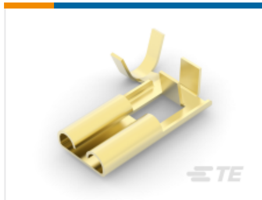
TE Part # 151791-1 FLAG FASTON RECEPTACLE