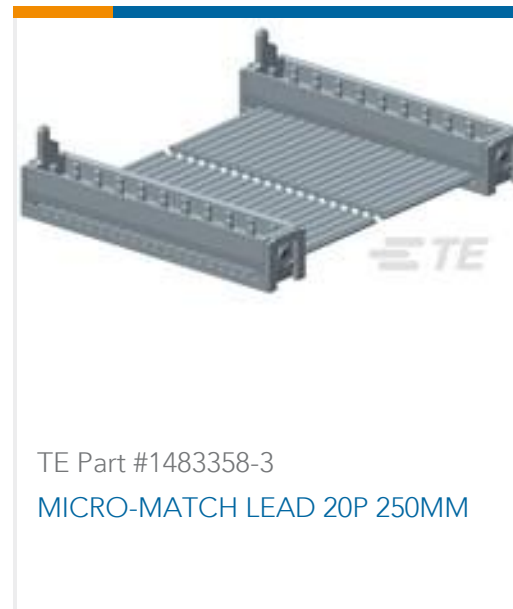
TE Part #1483358-3 MICRO-MATCH LEAD 20P 250MM