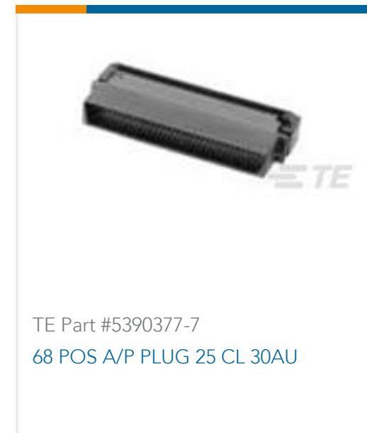
TE Part #5390377-7 68 POS A/P PLUG 25 CL 30AU