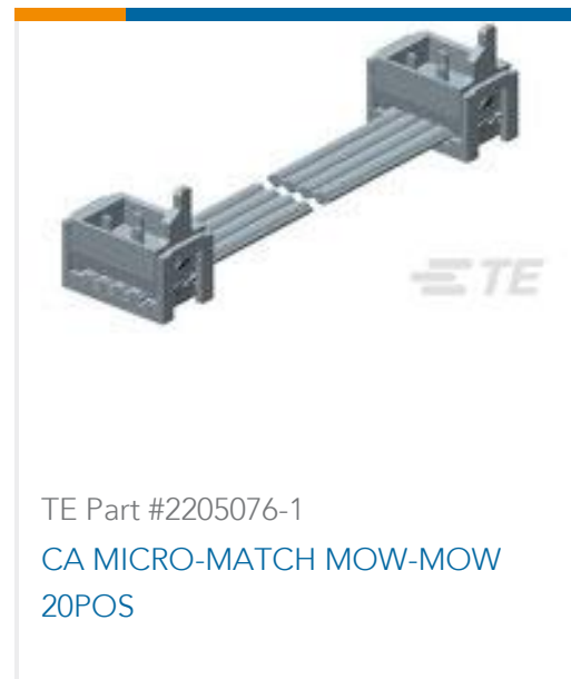
TE Part #2205076-1 CA MICRO-MATCH MOW-MOW 20POS