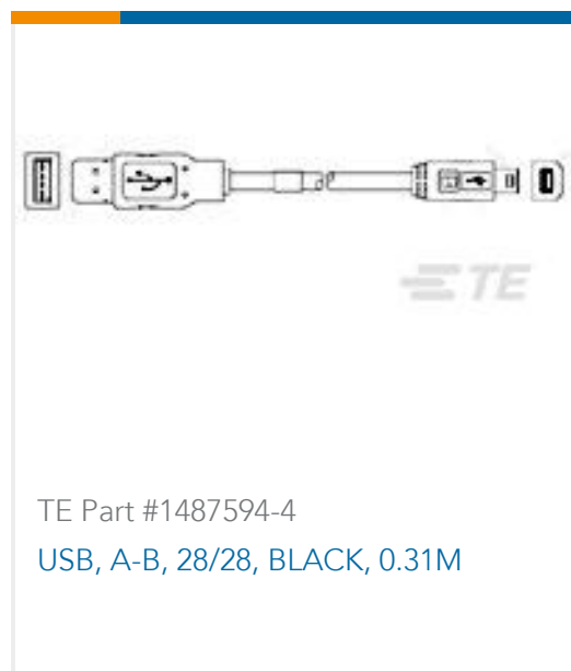
TE Part #1487594-4 USB, A-B, 28/28, BLACK, 0.31M