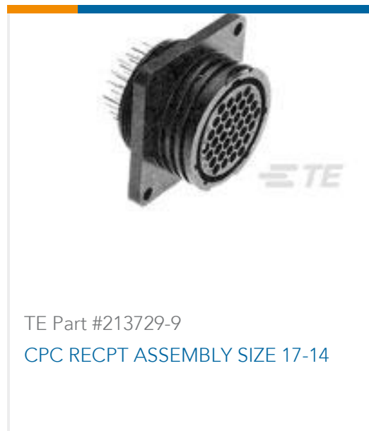
TE Part #213729-9 CPC RECPT ASSEMBLY SIZE 17-14