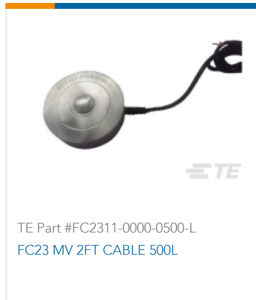
TE Part #FC2311-0000-0500-L FC23 MV 2FT CABLE 500L