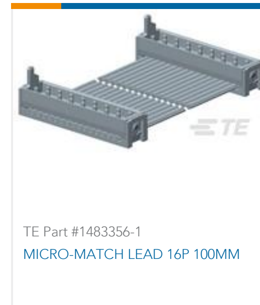
TE Part #1483356-1 MICRO-MATCH LEAD 16P 100MM