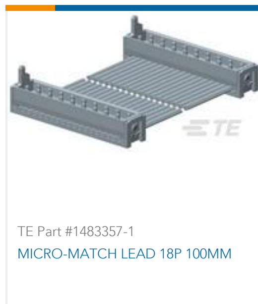
TE Part #1483357-1 MICRO-MATCH LEAD 18P 100MM