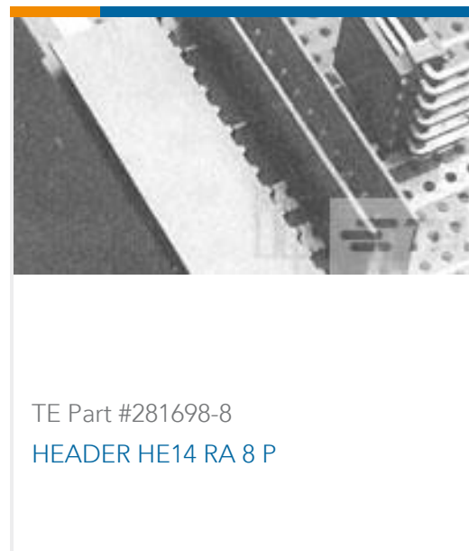
TE Part #281698-8 HEADER HE14 RA 8 P