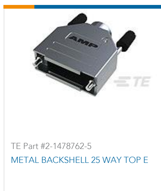
TE Part #2-1478762-5 METAL BACKSHELL 25 WAY TOP E