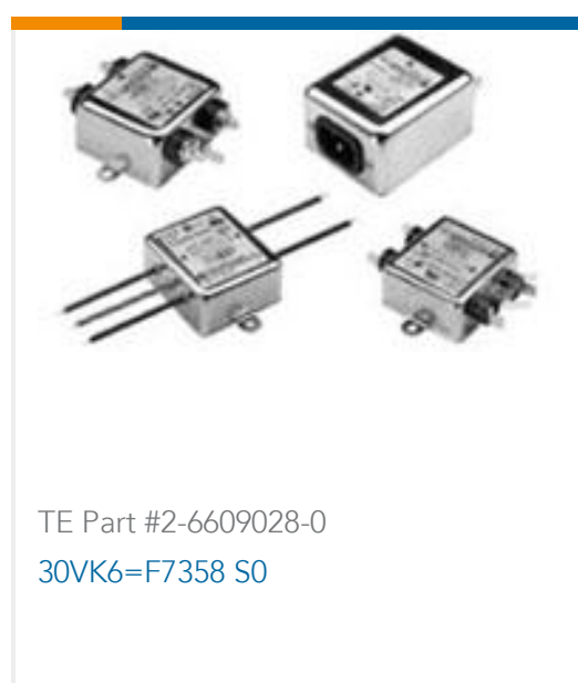
TE Part #2-6609028-0 30VK6=F7358 S0