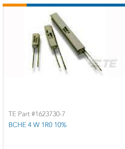
TE Part #1623730-7 BCHE 4 W 1R0 10%