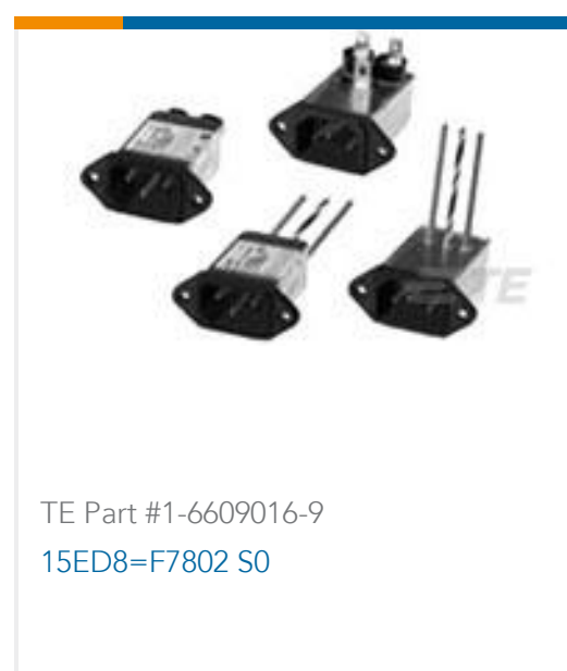
TE Part #1-6609016-9 15ED8=F7802 S0