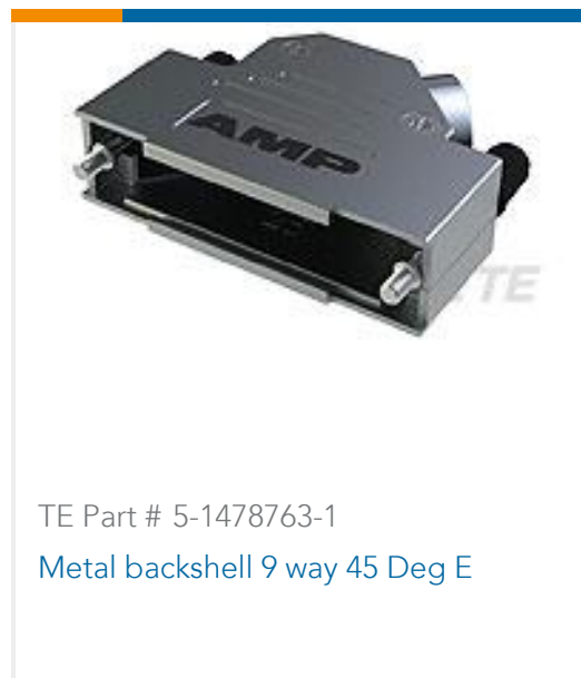
TE Part # 5-1478763-1 Metal backshell 9 way 45 Deg E