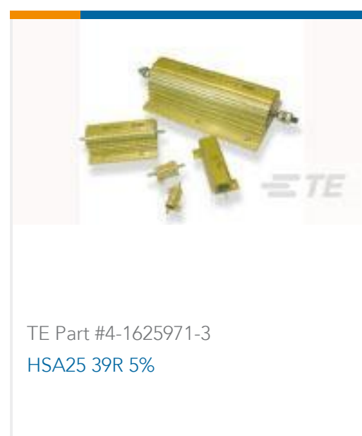
TE Part #4-1625971-3 HSA25 39R 5%