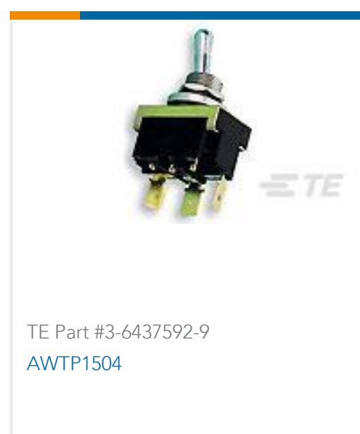
TE Part #3-6437592-9 AWTP1504