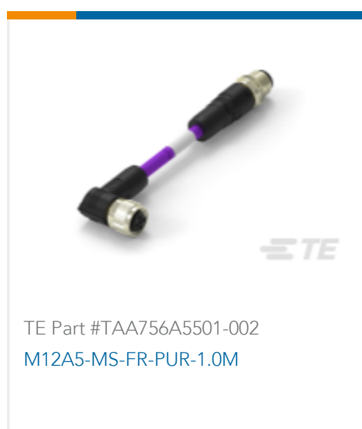
TE Part #TAA756A5501-002 M12A5-MS-FR-PUR-1.0M