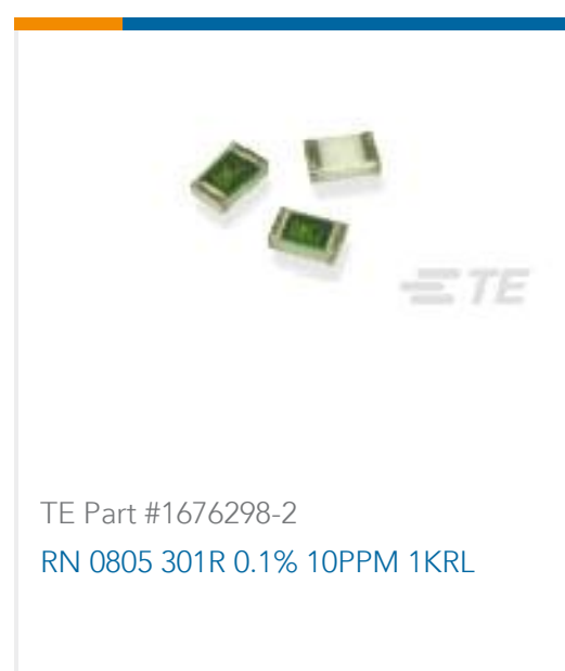
TE Part #1676298-2 RN 0805 301R 0.1% 10PPM 1KRL