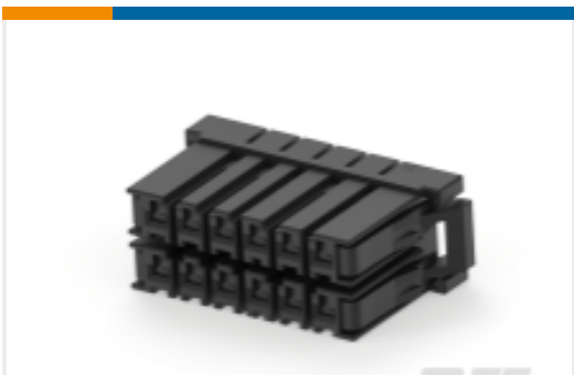
TE Part #2-179553-2 Receptacle and Tab Housing: 5.08 mm Pitch, 250-600V