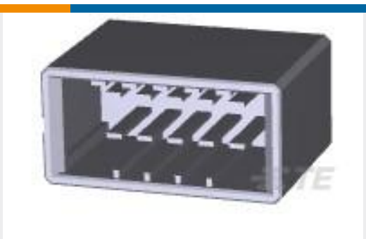
TE Part #178325-3 DYNAMIC D3100D HDR V 10P ASSY AU076