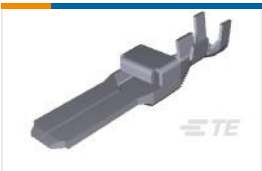
TE Part #917804-2 DYNAMIC D-5 TAB CONT. S L/P