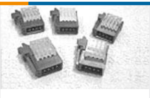
TE Part #2-1473562-3 RITS CONN. PLUG ASSY 3P BLUE AU076