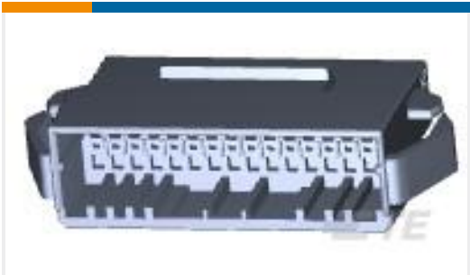
TE Part #1-1903128-6 DYNAMIC 1100D TAB HSG 32P P/M