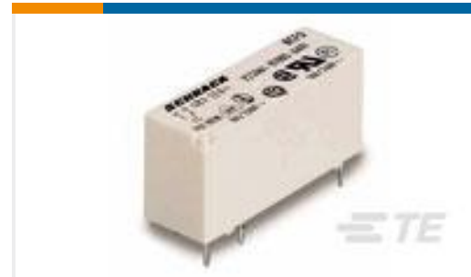
TE Part #9-1393222-7 V23061B1005A501=MINISTARKSTROM