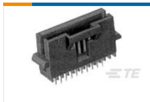
TE Part #5-146085-1 10 SYSTEM 50 HDR SRST SHRD SN