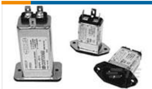
TE Part #6609006-5 3EEJ1=F8009 S0