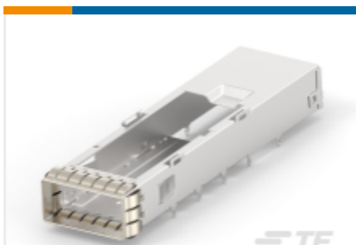
TE Part #2324171-2 CAGE ASSEMBLY, QSFP-DD 1X1, SPRING