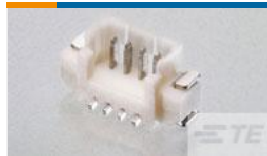
TE Part #1734260-6 1.25 WTB HDR SMT, 6 POS