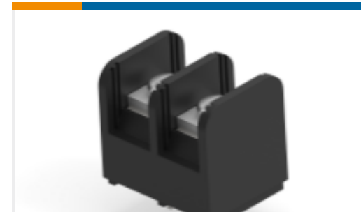
TE Part #1-1776249-1 JC6-P108-02-161=JC6-ASSY