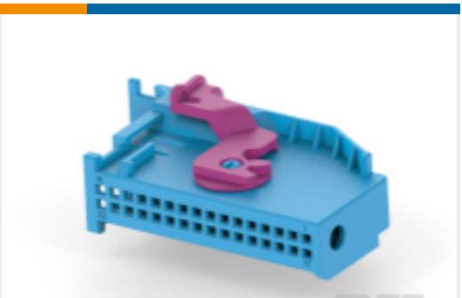
TE Part #2050723-2 COVER FOR MQS HSG 2x16 POS ASSY