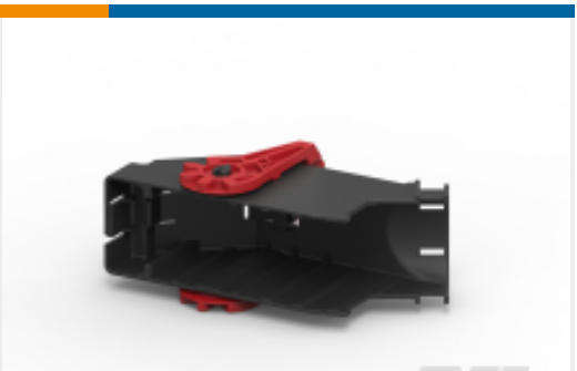
TE Part #2278586-1 67 POS COVER ASSY TYPE180