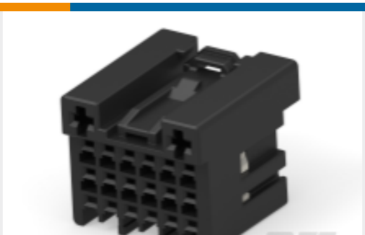
TE Part #2298671-1 20POS,HYBRID,REC HSG ASSY, UNSLD,COD A