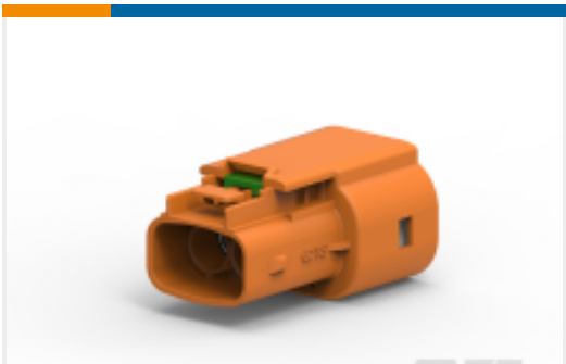
TE Part #1-2103177-1 PLUG ASSY, KEY A, TA, HVA280-2PHI XE