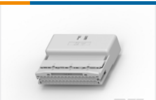
TE Part #2005091-1 025 32P CAP ASSY