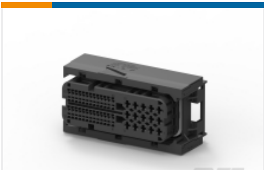
TE Part #2278584-1 67 POS,MIXED,REC HSG,ASSY, SEALED TYPE180