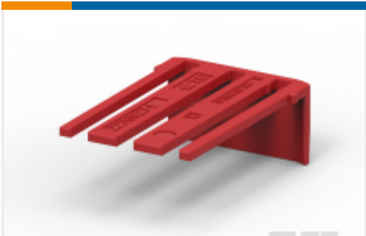
TE Part #2278827-1 2. LOCK,67POS_FOR_MCP2.8