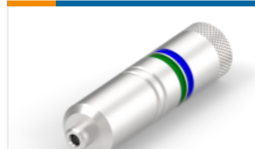
TE Part #C0-0003-000-000 POSITIONING INSERT FOR 1 MM CONTACTS