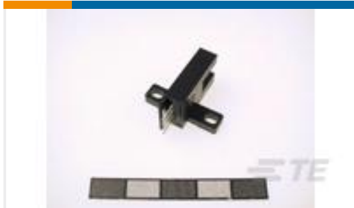
TE Part #4-509186-5 FORK LIGHT BARRIER