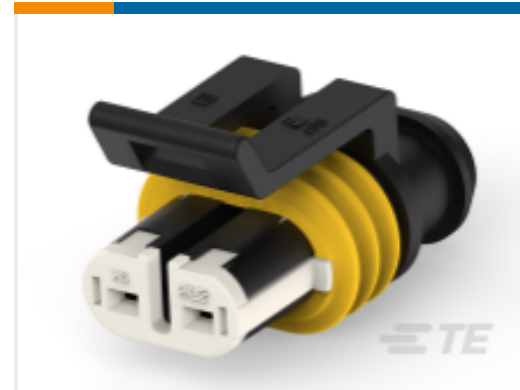
TE Part #1745096-1 AMP SUPERSEAL 1,5 SRS. 2 POS. PLUG ASS'Y