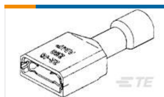
TE Part #2-520273-2 ULTRAFAST 110 ASSY REC 22-18 TPBR LP