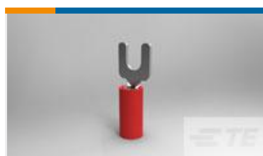
TE Part #34541 PIDG SPD 22-16 COMM 22-18MIL 6