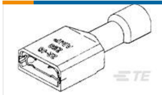
TE Part #2-520184-2 ULTRAFAST 250 ASSY REC 22-18 TPBR LP