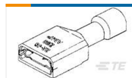
TE Part #3-520125-2 ULTRAFAST 187 ASSY REC 16-14 TPBR LP