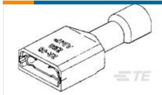
TE Part #2-520194-2 ULTRAFAST 187 ASSY REC 22-18 TPBR LP