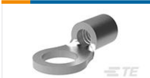
TE Part #34105 SOLIS R 22-16 COMM 22-18 MIL 6