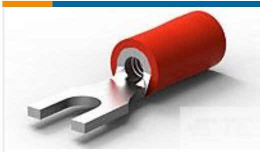
TE Part #165004 PLASTI-GRIP, SPADE 22-16 4