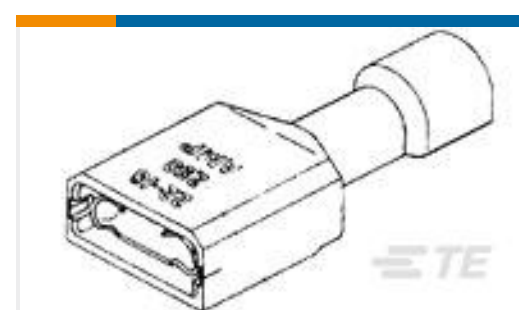
TE Part #2-520182-2 ULTRAFAST 187 ASSY REC 22-18 TPBR LP