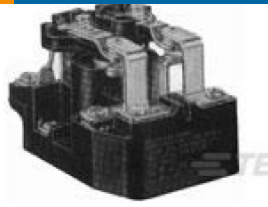
TE Part #8-1393127-6 PRD-3DH0-24=PRD