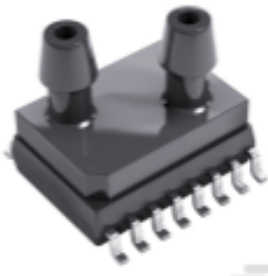
TE Part #9235-BCE-S-300-000 300PA DIFF. DIGITAL PRESSURE SENSOR