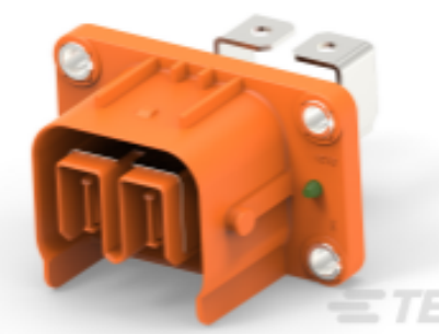
TE Part #1-2310224-1 2POS, PCON12, HDR ASSY, COD A, L.V.