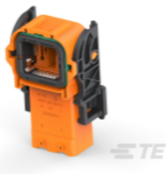
TE Part #2310213-1 2POS, PCON12, REC HSG ASSY, 90DEG, SLD, COD A