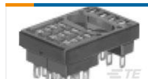
TE Part #1419111-5 24A071=CLIP,SKT,ASSY,W/SCW