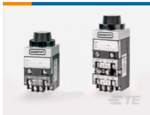
TE Part # 3-1423159-3 7012PJ=RLY,STD,ON,2P,125VDC,1