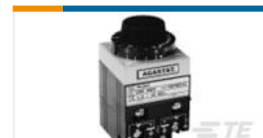
TE Part #2-1423157-0 7012AH=RLY,STD,ON,2P,120VAC,30