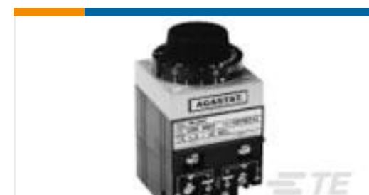
TE Part #1423162-2 7022AB=RLY,STD,OFF,2P,120VAC,5