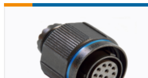
TE Part #YDTS26Z17-06PNV001 PLUG ASSY