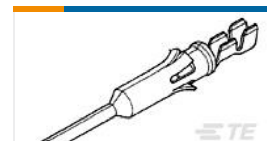
TE Part #66589-4 TYPE VI PIN,MULTI-MATE,L.P.