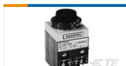
TE Part #1423157-2 7012AB=RLY,STD,ON,2P,120VAC,5S