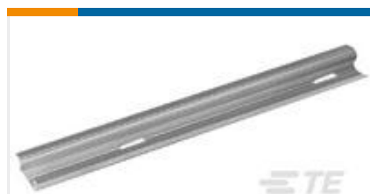
TE Part #1419111-6 24A110=TRACK,MOUNTING