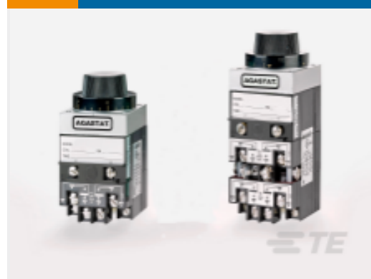
TE Part # 5-1423159-5 7012SJX=RLY,STD,ON,2P,250VDC,