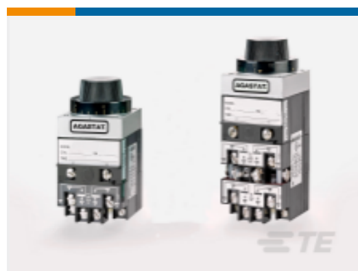
TE Part # 6-1437487-5 7012MDI=28V DC 5-50 SEC