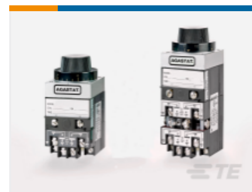
TE Part # 7-1472995-9 7012WEV=RLY,STD,ON,2P,96V,200S,V