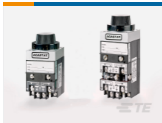
TE Part # 6-1472995-2 7012OBILM=RLY,STD,ON,2P,24V,5S,I, L,M