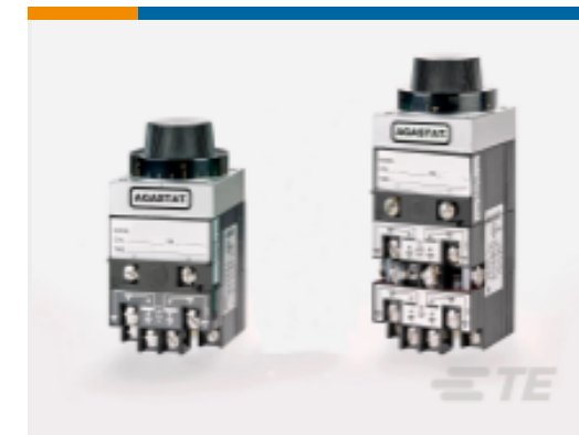
TE Part # 6-1423157-8 7012BH=RLY,STD,ON,2P,240VAC