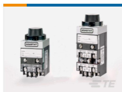
TE Part # 1423166-1 7024MD=RLY,STD,OFF,4P,28VDC,5