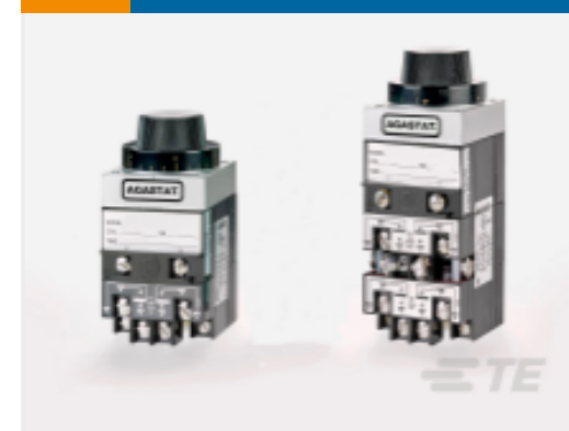
TE Part # 1-1472969-1 7022WCI=RLY,STD,OFF,2P,96VDC,I2 OPTION