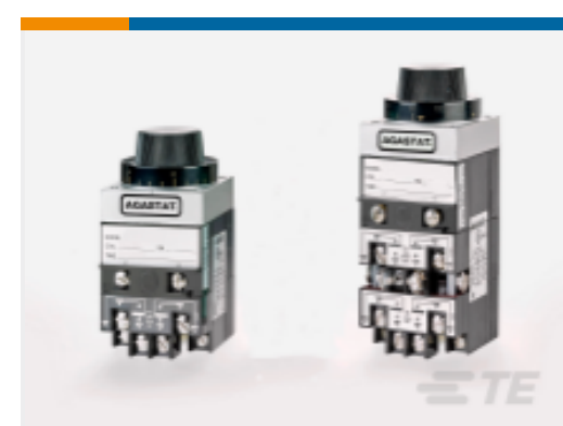
TE Part # 1-1423166-3 7024PC=RLY,STD,OFF,4P,125VDC,1