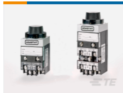
TE Part # 2-1423158-2 7012L10DY1N=