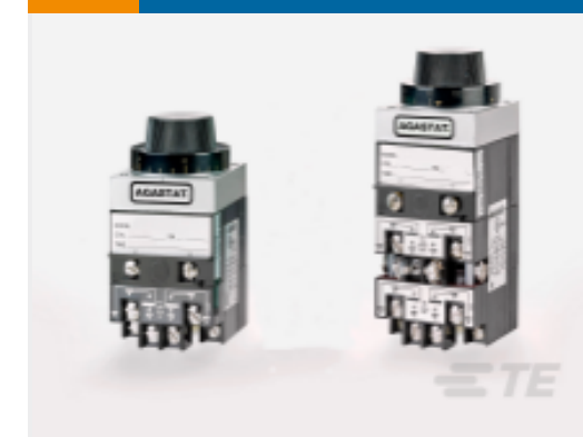
TE Part # 1472969-8 7022OFA2=RLYS,STD,OFF,2P,24VDC, 10MIN,A2