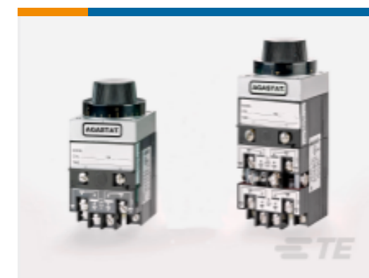
TE Part # 1-1423164-0 7022OD=RLY,STD,OFF,2P,24VDC,5