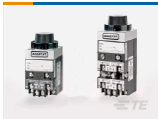
TE Part # 1755150-3 7012FA=RLY,STD,ON,2P,127V50HZ,1S