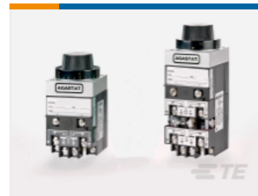
TE Part # 4-1423159-8 7012SB=RLY,STD,ON,2P,250VDC,5