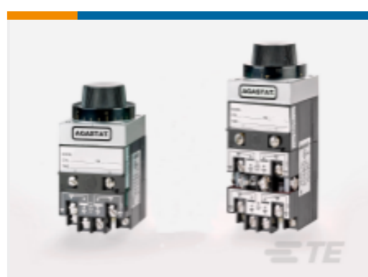
TE Part # 1423165-8 7024AF=RLY,STD,OFF,4P,120VAC,1