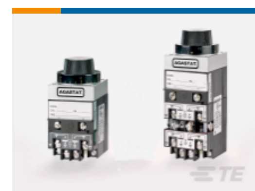
TE Part # 5-1423162-7 7022AET=RLY,STD,OFF,2P,120VAC,