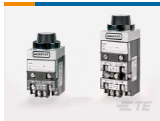
TE Part # 3-1472981-9 7022JB=RLY,STD,OFF,2P,208V,5S