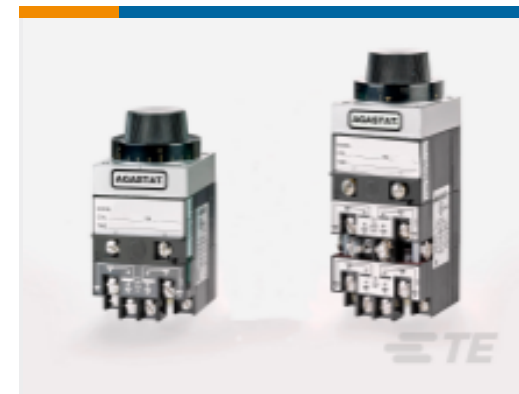
TE Part # 2-1472973-9 7012WCIM=RLY,STD,ON,2P,96VDC, 15SEC,I2 OP