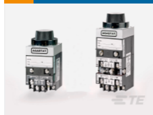
TE Part # 1-1437453-7 7022BCX=RLY,STD,OFF,2P,240VAC