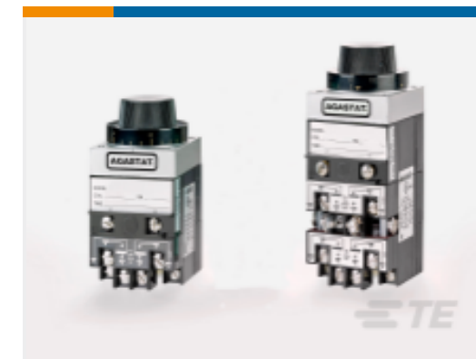
TE Part # 4-1423157-4 7012JC=RLY,STD,ON,2P,208VAC,1