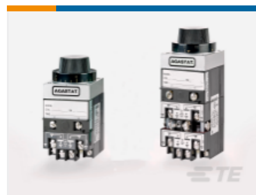
TE Part # 6-1472981-3 7022L8B=RLY,STD,OFF,2P,110V,5S