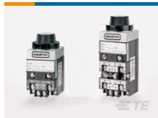
TE Part #4-1437484-4 E7022PH004=RLY,NUC,OFF,2P,125