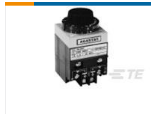
TE Part #1-1423169-2 E7012PE004=RLY,NUC,ON,2P,125V