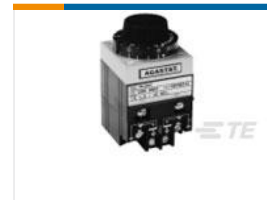
TE Part #1423170-3 E7022AC004=RLY,NUC,OFF,2P,120