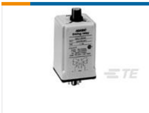
TE Part #4-1437470-6 SSC12ABA=120V 50/60HZ .5/15 SE