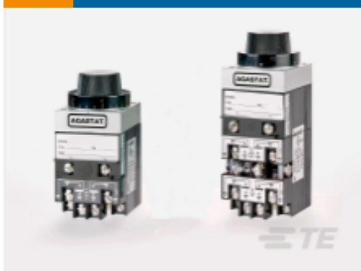
TE Part # 1423162-5 7022AC=RLY,STD,OFF,2P 120VAC,1