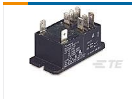
TE Part #4-1393211-3 T92P11A22-24