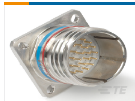
TE Part #YDTS20F25-35SNV001 RECP ASSY