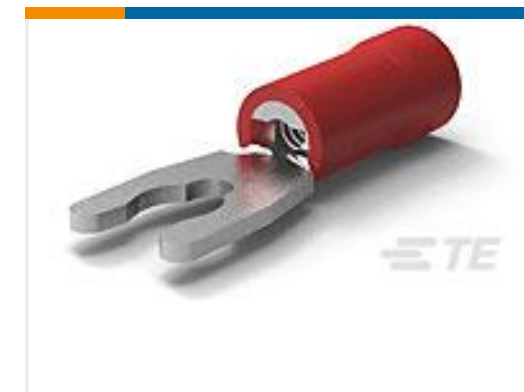
TE Part #53240-1 PG SP SPD 22-16COMM22-18MIL 6