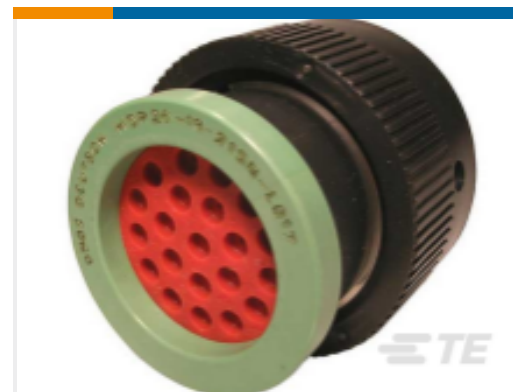
TE Part #HDP26-18-21SN-L017 PLG, 21P, BLK, N, RNG, 20, S