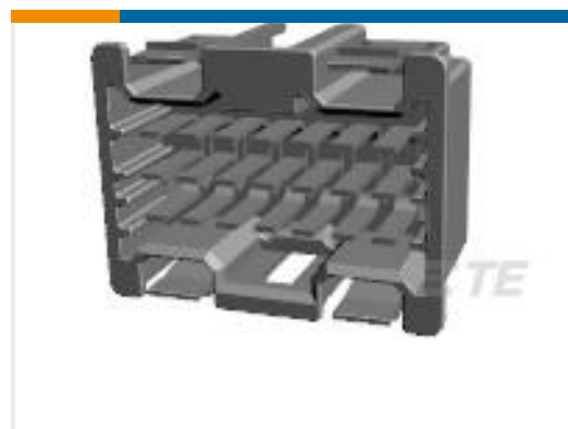
TE Part #2-1394765-1 2.8FLA-STE-GEH 21P