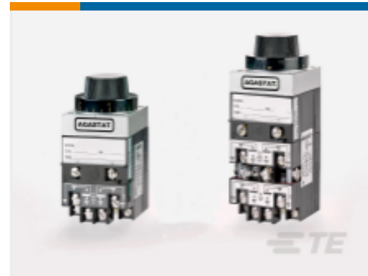
TE Part # 1477628-1 7014ZB 22VDC, 0.7-7SEC