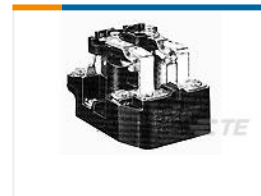
TE Part #7-1393127-6 PRD-3AP4-120=PRD