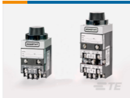
TE Part # 1-1423162-8 7022AK=RLY,STD,OFF,2P,120VAC,1