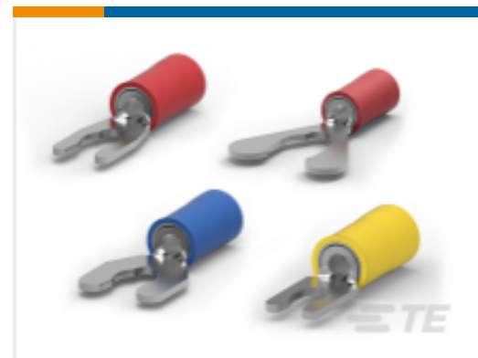
TE Part #52937 PIDG Short Spring Spade Tongue Terminals