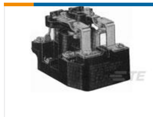
TE Part #2-1393127-9 PRD-11AY0-24=PRD