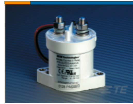
TE Part #8-1618404-5 EV200DAANA=CONTACTOR, SPST-NC