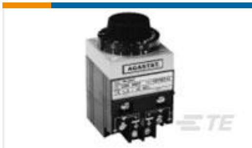
TE Part #2-1423164-0 7022PC=RLY,STD,OFF,2P,125VDC,1