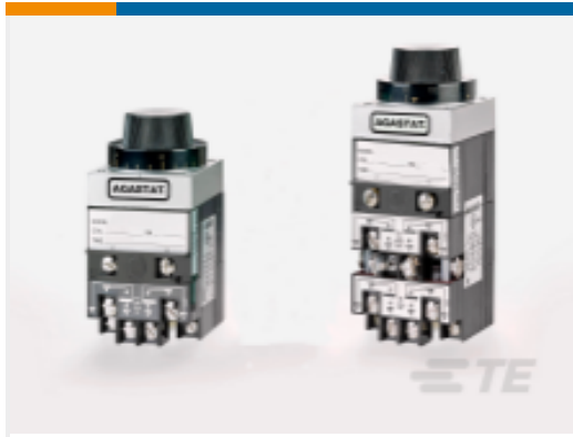
TE Part # 1423162-5 7022AC=RLY,STD,OFF,2P 120VAC,1