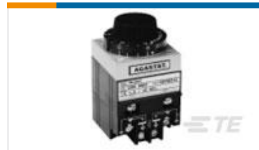
TE Part #1423159-6 7012NF=RLY,STD,ON,2P,48VDC,10