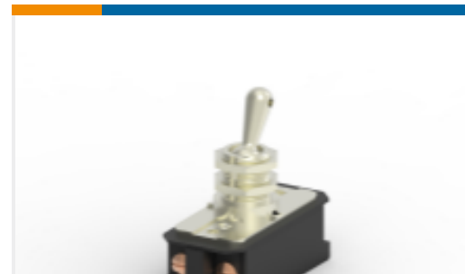
TE Part #1520237-2 7320K3=8 AMP TOGGLE SWITCH