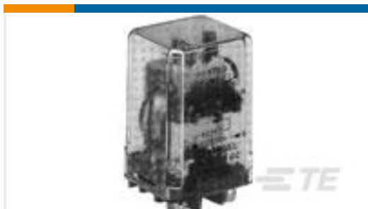
TE Part #2-1393115-7 KUL-11A15S-24=KU