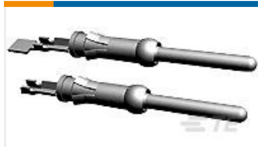
TE Part #1-66361-6 III+PIN,18-14,TIN,LP,SN