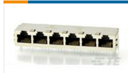
TE Part #5557572-3 MOD JK ASSY,6PORT,8POSN,SHLD