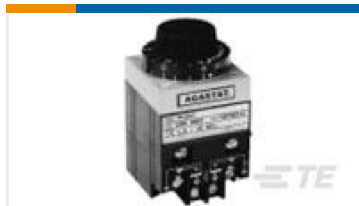
TE Part #1-1423162-9 7022AKT=RLY,STD,OFF,2P,120VAC