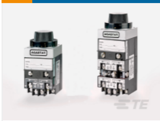
TE Part # 2-1423162-9 7022BK=RLY,STD,OFF,M2P,240VAC,