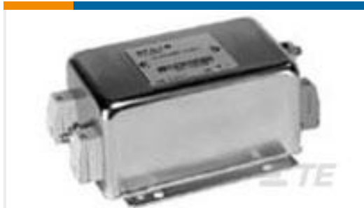
TE Part #6609069-3 16FC10 J0=F7740