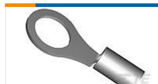
TE Part #31805 TERMINAL,SOLIS R 12-10 10