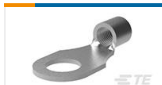
TE Part #34484 TERMINAL,SOLIS R 14-12 10