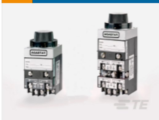
TE Part # 2-1423159-6 7012PD=RLY,STD,ON,2P,125VDC,50