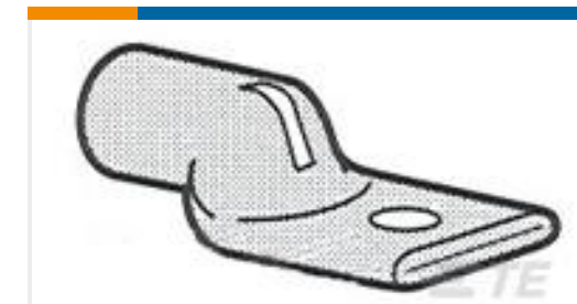
TE Part #325605 TERMINAL,AMPOWER 4/0 1/2