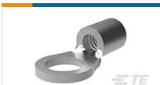
TE Part #35135 TERMINAL,SOLIS R 12-10 1/2