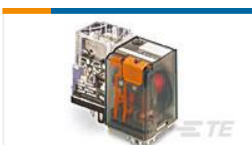
TE Part #5-1393104-1 KRPA-11DN-24=KRPA