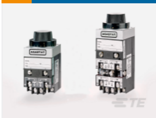
TE Part # 1423157-5 7012AC=RLY,STD,ON,2P,120VAC,15