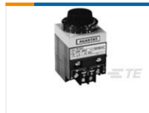
TE Part #1423162-7 7022AD=RLY,STD,OFF,2P,120VAC,5