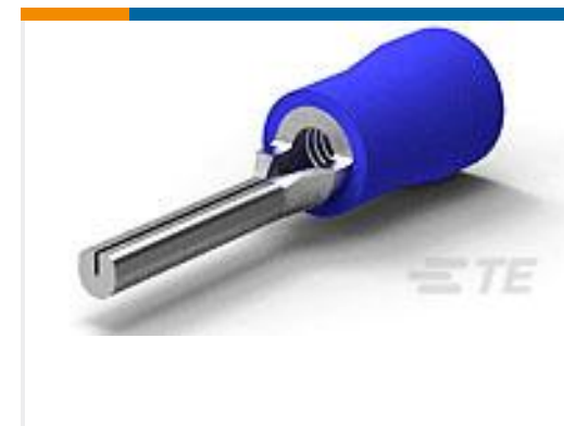
TE Part #165171 P.G. WIRE PIN 16-14