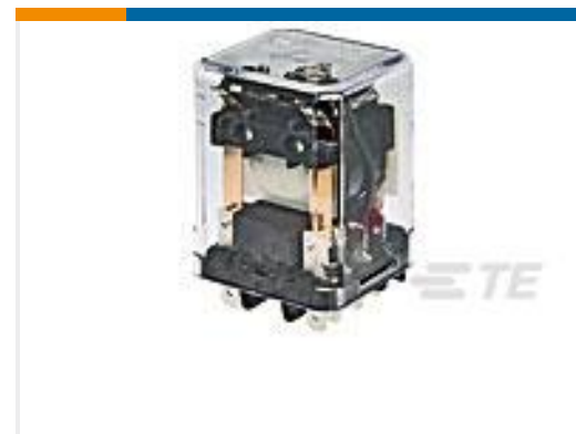
TE Part #8-1393113-7 KUEP-11D15-24=KU-