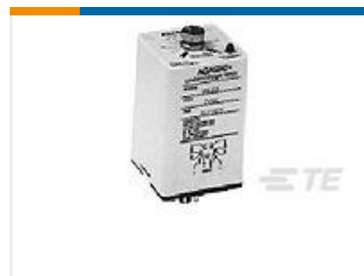
TE Part #3-1437466-5 VMAXBA=*