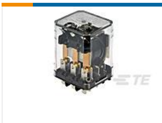
TE Part #5-1393117-8 KUP-11D55-24=KU