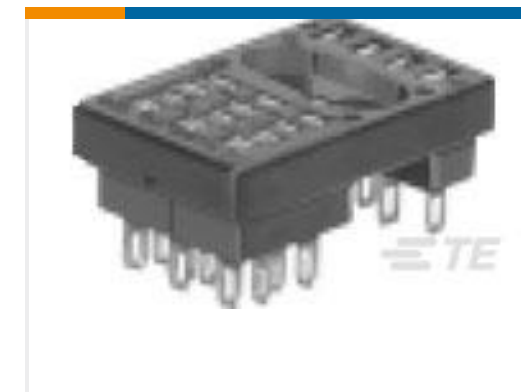
TE Part #1419111-5 24A071=CLIP,SKT,ASSY,W/SCW