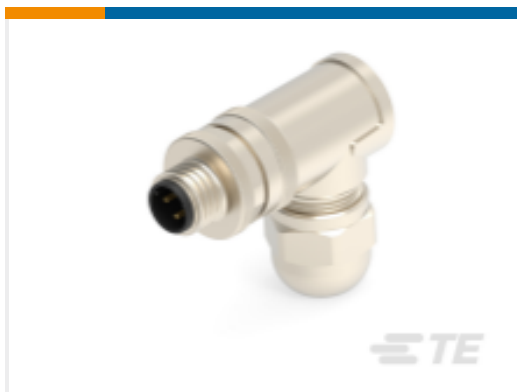
TE Part #T4113512041-000 M12 M, 4P GOLD D_CODE RA SHIELDED PG9