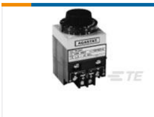
TE Part #1-1423157-5 7012AF=RLY,STD,ON,2P,120VAC,10