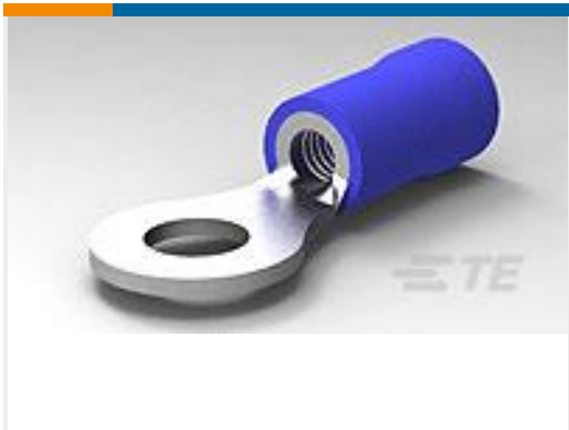
TE Part #34160 TERMINAL,PG R 16-14 8