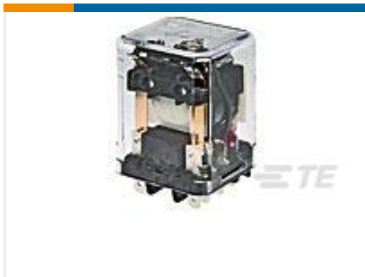
TE Part #8-1393113-8 KUEP-11D15-48=KU