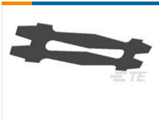
TE Part #192004-8 BAND STRIP LA1A(.006)SIL