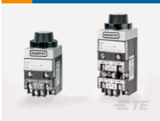
TE Part # 3-1423159-3 7012PJ=RLY,STD,ON,2P,125VDC,1