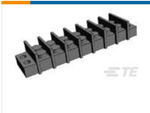
TE Part #1546306-7 7P .374" DR BARRIER STRIP