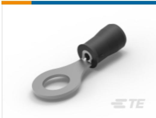
TE Part #320552 PIDG Ring Tongue Terminals