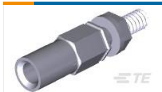
TE Part #200875-7 SKT ASSY, M SERIES