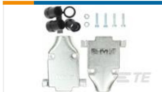
TE Part #5748676-2 DIE CAST CBL CLMP KIT, SZ 2