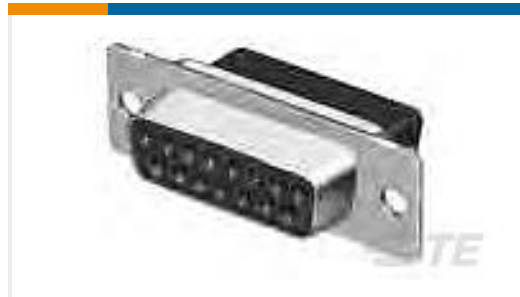
TE Part #205205-2 CRIMP SNAP RCPT ASSY, SIZE 2