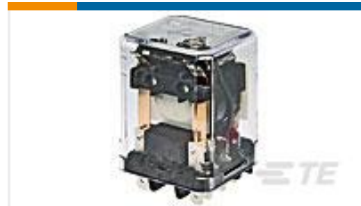
TE Part #8-1393113-3 KUEP-11A15-120=RELAY, GENPUR, OC