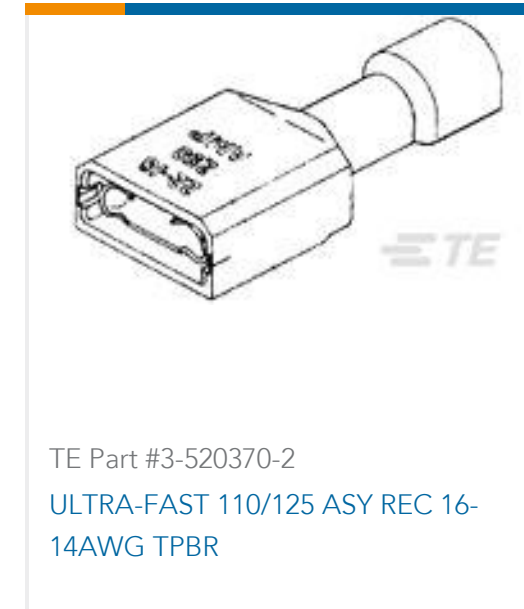
TE Part #3-520370-2 ULTRA-FAST 110/125 ASY REC 16- 14AWG TPBR