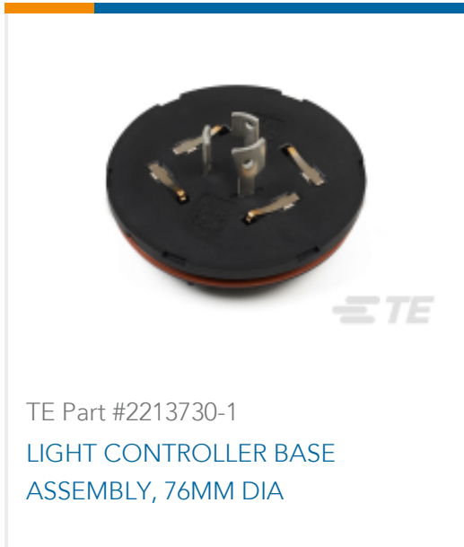
TE Part #2213730-1 LIGHT CONTROLLER BASE ASSEMBLY, 76MM DIA