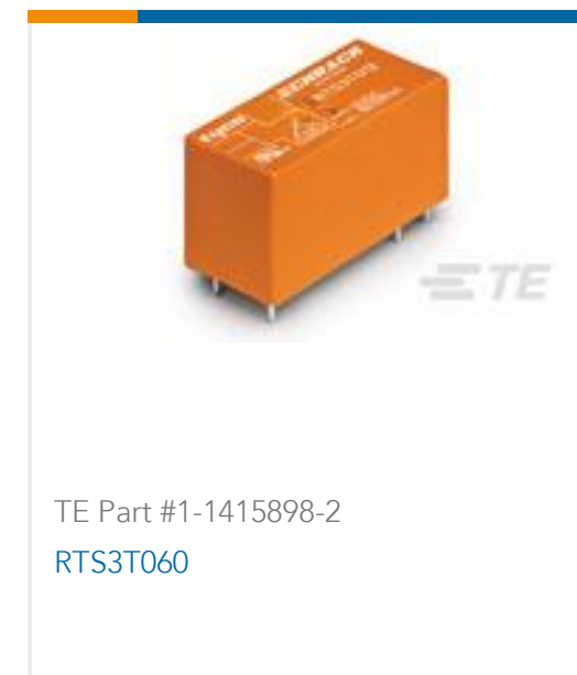
TE Part #1-1415898-2 RTS3T060