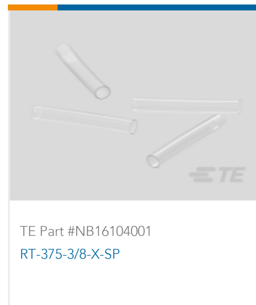
TE Part #NB16104001 RT-375-3/8-X-SP