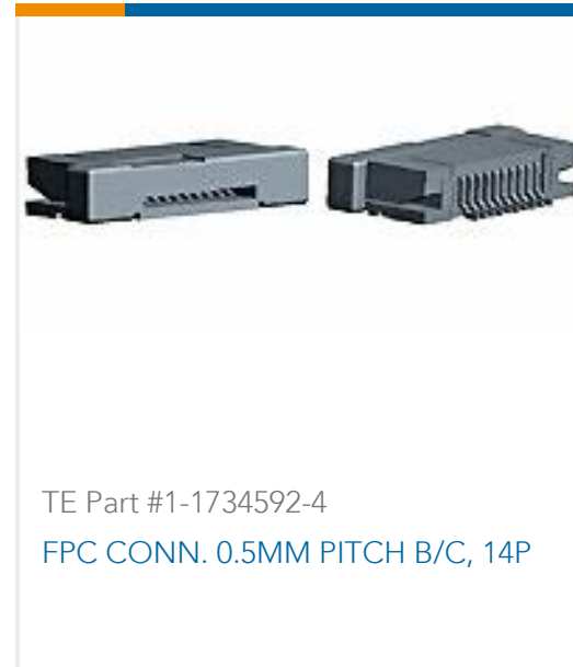
TE Part #1-1734592-4 FPC CONN. 0.5MM PITCH B/C, 14P