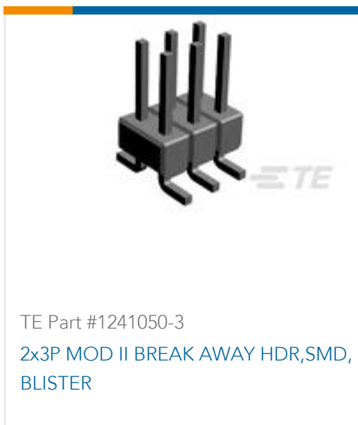
TE Part #1241050-3 2x3P MOD II BREAK AWAY HDR,SMD, BLISTER