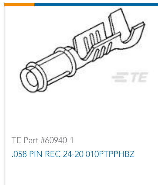
TE Part #60940-1 .058 PIN REC 24-20 010PTPPHBZ