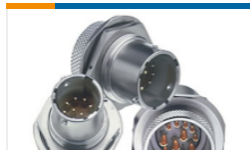
TE Part #AS07PT12-98PN HERMETIC FUEL TANK C ONNECTOR