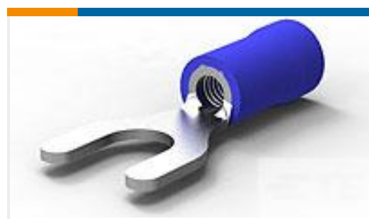
TE Part #34167 TERMINAL,PG SPD 16-14 10