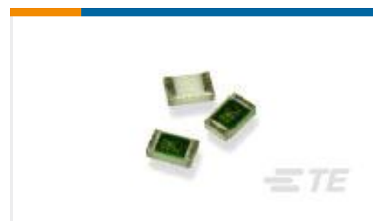
TE Part #7-1614891-9 CPF 0805 475R 0.1% 25PPM 1K RL