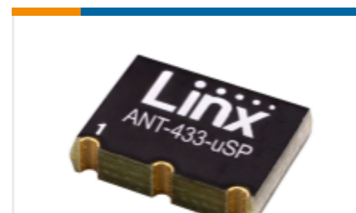
TE Part #L9000122-01 Antenna uSP PCB RPC 433MHz SMT T&R