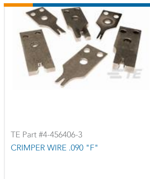
TE Part #4-456406-3 CRIMPER WIRE .090 "F"