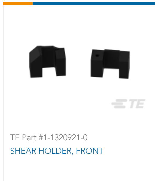
TE Part #1-1320921-0 SHEAR HOLDER, FRONT