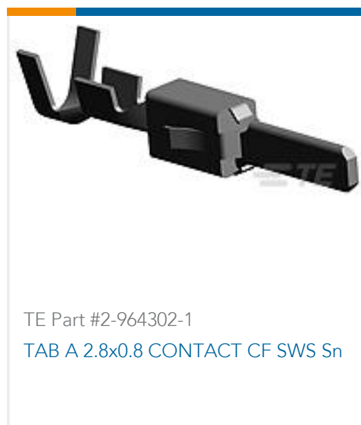
TE Part #2-964302-1 TAB A 2.8x0.8 CONTACT CF SWS Sn