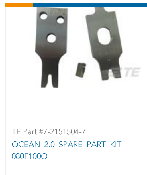
TE Part #7-2151504-7 OCEAN_2.0_SPARE_PART_KIT-080F100O