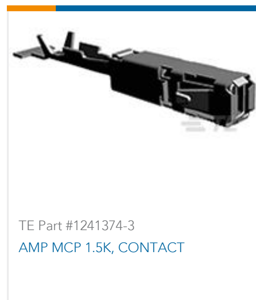
TE Part #1241374-3 AMP MCP 1.5K, CONTACT