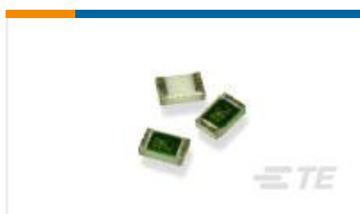
TE Part #6-1879215-6 CPF 0402 22K1 0.1% 25PPM 1K RL