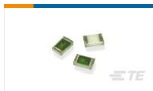
TE Part #9-1614353-1 RN 0603 49R9 0.1% 10PPM CUT LENGTH