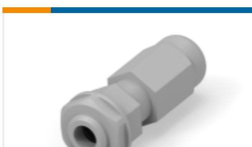
TE Part #1478768-1 ANTI-VIB NYLON GLD 12MM GREY