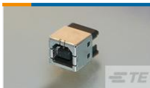
TE Part #1-1734346-1 STD USB TYPE B, R/A, SMT