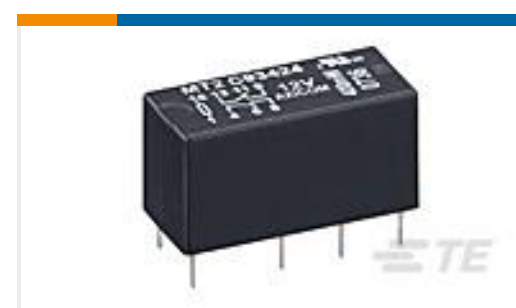
TE Part #1462000-7 C93402=MT Relay 150 mW 12 V