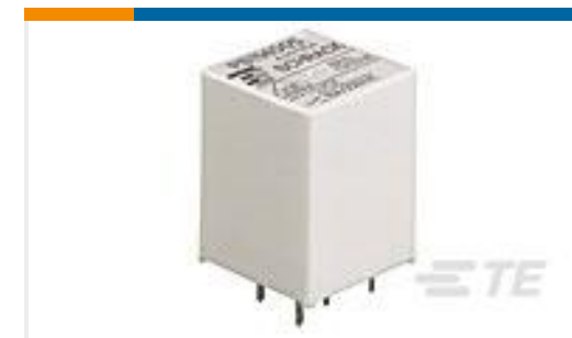
TE Part #8-1415029-1 PB114012