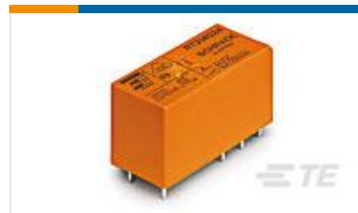
TE Part #1-1393243-0 RTE24024