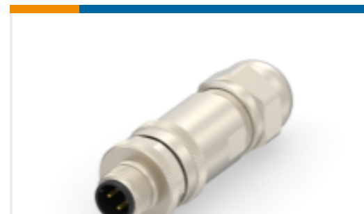
TE Part #T4111511041-000 M12 M, 4P GOLD D_CODE S SHIELDED PG7