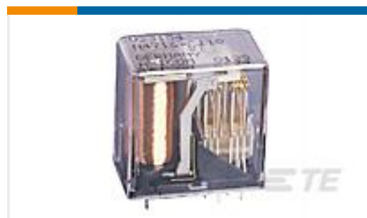
TE Part #2-1393810-7 V23154M 721B104