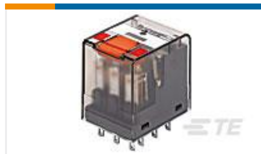
TE Part #9-1419111-0 PT570615