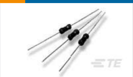
TE Part #1-1625893-6 5W SM M/OX 5% 510K