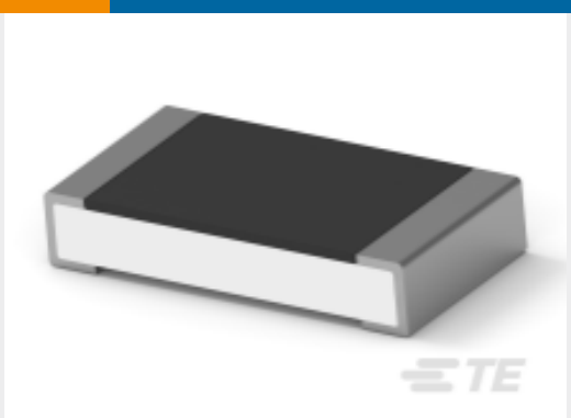
TE Part #7-2176391-3 RQ 1206 69K8 0.1% 10PPM 5K RL