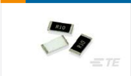
TE Part #2-1622824-8 RL73H 3A R27 1% 4K RL