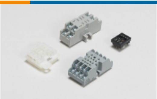
Relay Accessories, Sockets & Clips(30)