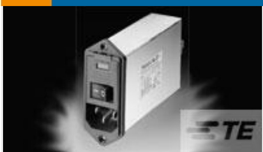
TE Part #2-1609109-6 PM0S0SLXC=C7074