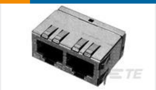
TE Part #5406562-1 MJ ASSY,2PORT,8POS,SHLD