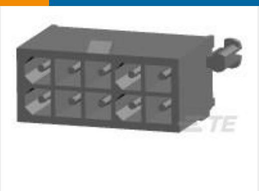
TE Part #770743-1 10P MINI UMNL HDR ASSY D/R VRT