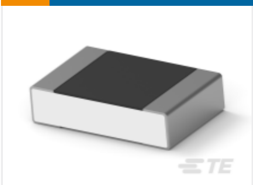
TE Part #7-2176381-1 RQ 0805 66K5 0.1% 10PPM 5K RL