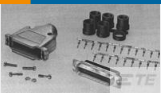
TE Part #749805-8 KIT,HDP-20,PLUG,SIZE 2, 15 POS