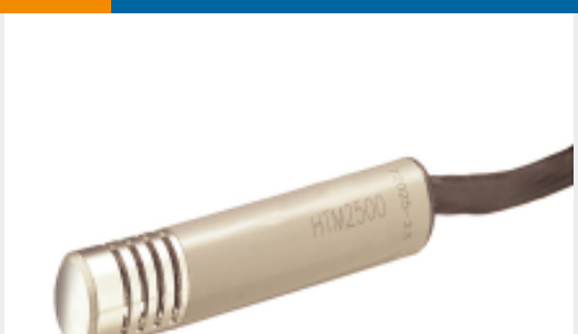
TE Part #HPP809A031 RH/T HTM2500LF TRANSDUCER