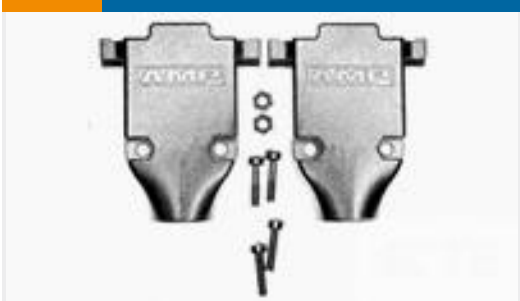
TE Part #5748678-1 2 PC PLST CBL CLMP KIT