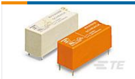
TE Part #7-1393224-6 RY531005