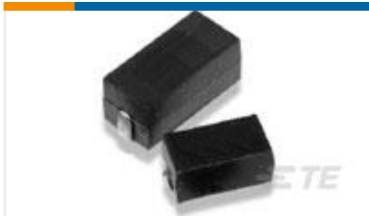
TE Part #6-1879022-9 SMF3 220K 5%