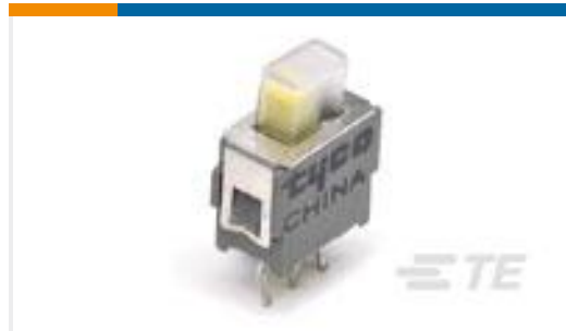
TE Part #1825032-1 SE1DGPC04=SEALED SLIDE SWITCH