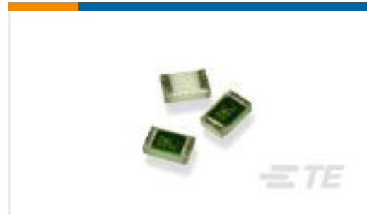
TE Part #1-1879216-5 CPF 0402 69K8 0.1% 25PPM 1K RL