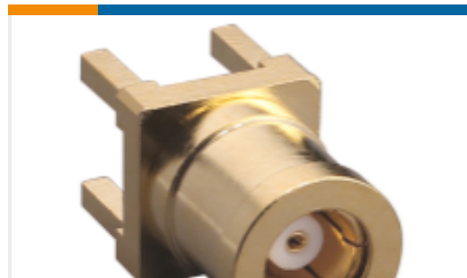
TE Part #CONSMB006-G SMB Plug 50 Ohm PCB Through Hole