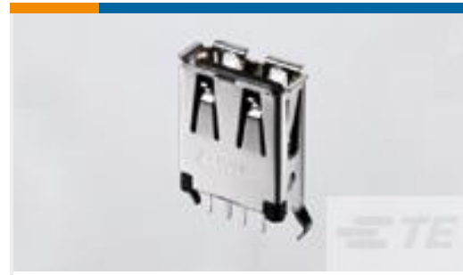
TE Part #1734366-2 Std USB Type A, VT, T/H, White