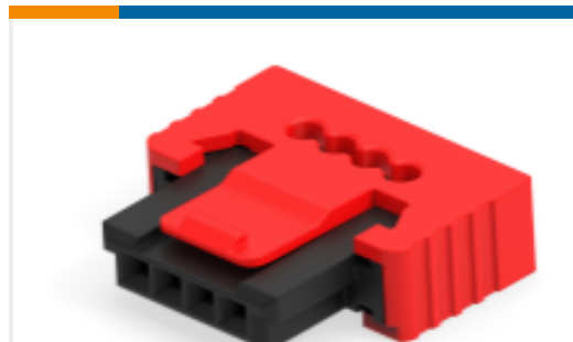
TE Part #214025-E SRCP 1,27 4 F 1 I2426 137 * 162 1,07 TRA