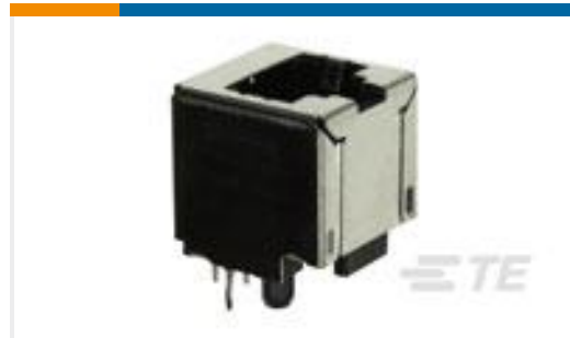
TE Part #6368150-1 MJ,TE,8P,CAT5,SHIELDED