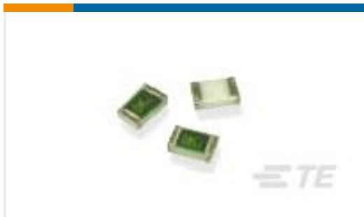
TE Part #1676218-2 RN 0805 1K02 0.1% 10PPM 1KRL