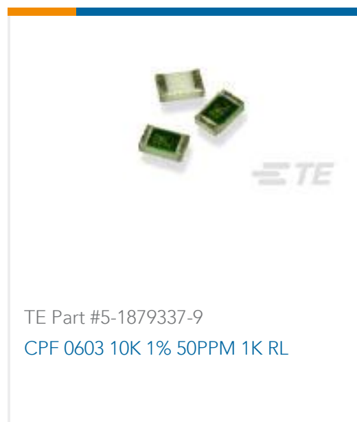
TE Part #5-1879337-9 CPF 0603 10K 1% 50PPM 1K RL