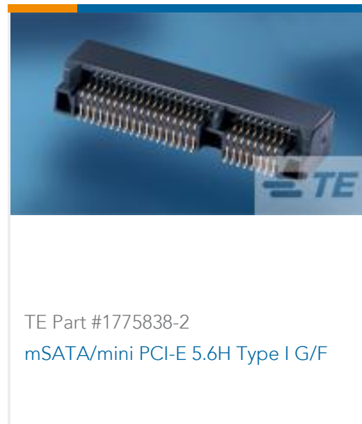
TE Part #1775838-2 mSATA/mini PCI-E 5.6H Type I G/F