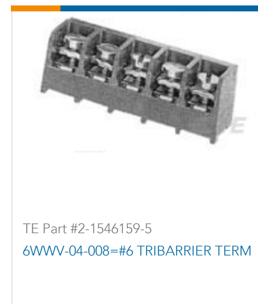
TE Part #2-1546159-5 6WWW-04-008=#6 TRIBARRIER TERM