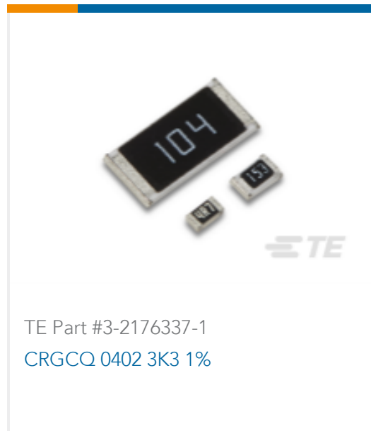
TE Part #3-2176337-1 CRGCQ 0402 3K3 1%