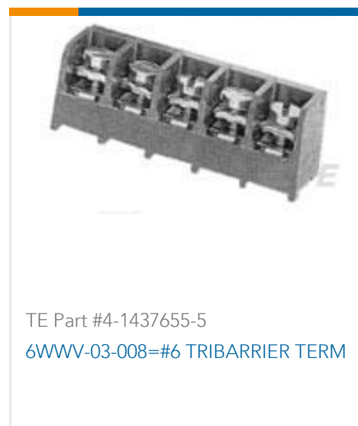
TE Part #4-1437655-5 6WWW-03-008=#6 TRIBARRIER TERM