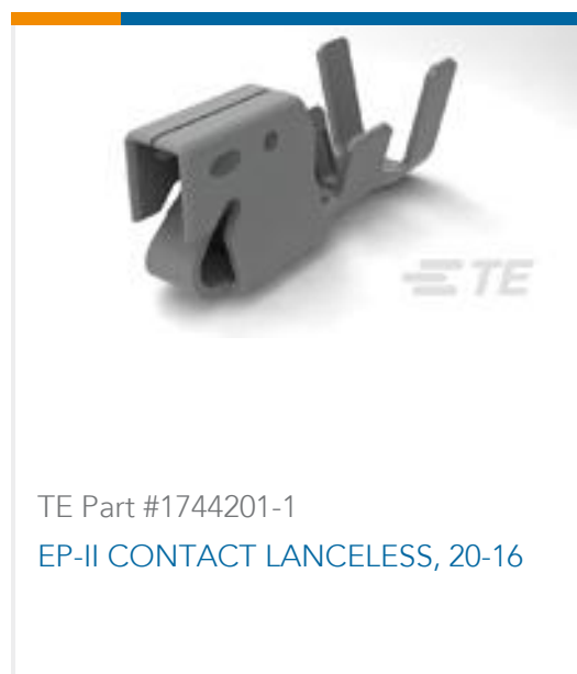
TE Part #1744201-1 EP-II CONTACT LANCELESS, 20-16