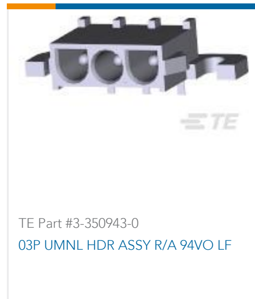
TE Part #3-350943-0 03P UMNL HDR ASSY R/A 94VO LF