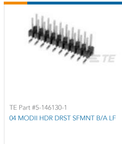
TE Part #5-146130-1 04 MODII HDR DRST SFMNT B/A LF