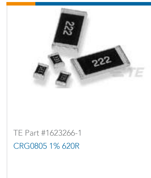
TE Part #1623266-1 CRG0805 1% 620R