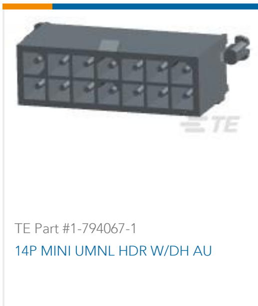
TE Part #1-794067-1 14P MINI UMNL HDR W/DH AU