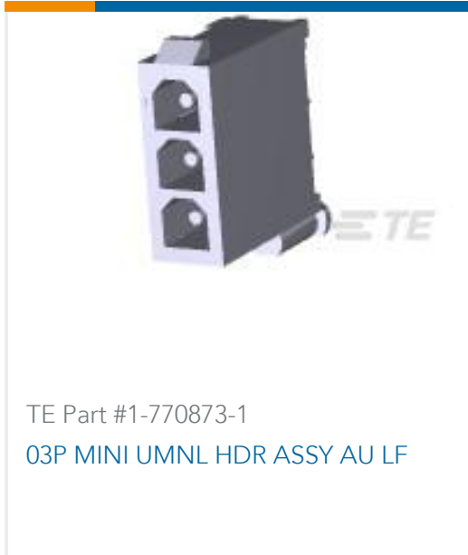
TE Part #1-770873-1 03P MINI UMNL HDR ASSY AU LF