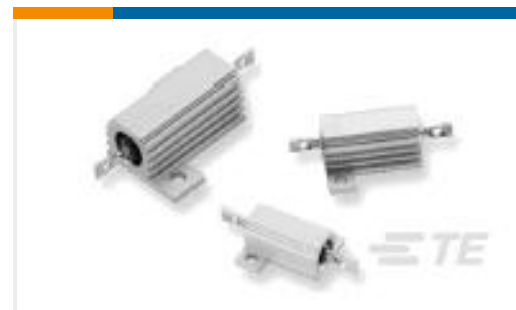
TE Part #3-1879074-8 THS15 1K0 5%