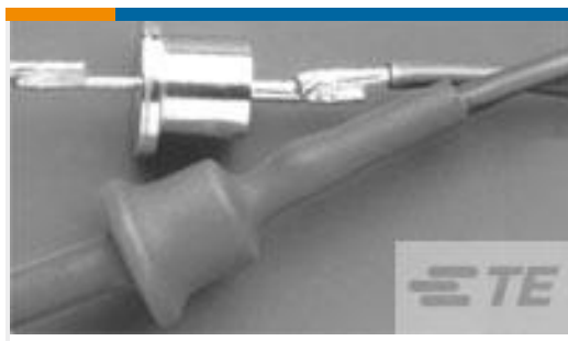
TE Part #5677564008 RNF-3000-3/1-0-SP