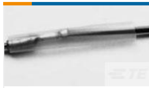
TE Part #CV20922001 RW-175-E-3/64-X-STK