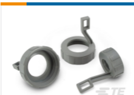
TE Part #M902-2041 DEUTSCH HD10 Backshells