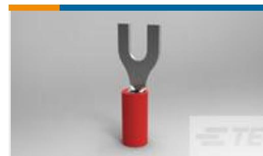
TE Part #130516 PIDG SPADE