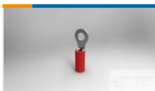
TE Part #36151 PIDG R 22-16 COMM 22-18 MIL 6