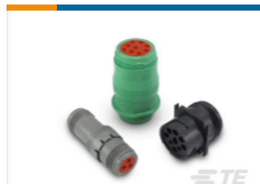
TE Part #HD10-3-96P DEUTSCH HD10 Housings