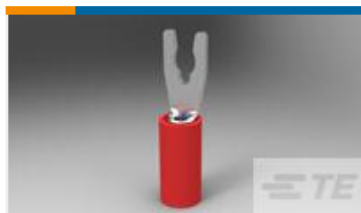
TE Part #52928 PIDG SPRSPD 22-16COM22-18MIL 5