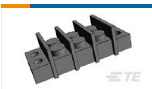
TE Part #1546306-3 3P .374" DR BARRIER STRIP