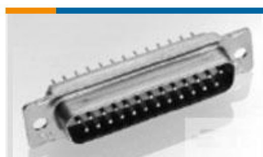
TE Part #205559-2 RECEPT ASSY, 25 POSN, AMPLIMITE