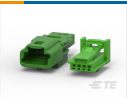
TE Part #1379665-5 TH/.025 CONNECTOR SYSTEM, HOUSING