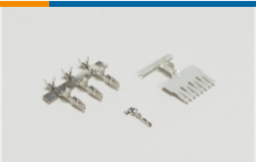
Busbars & Terminals(4)