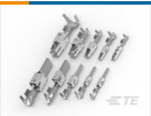
TE Part #963711-1 TIMER, RECEPTACLE AND TAB