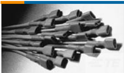
TE Part #4557596008 LSTT-19-2-80MM