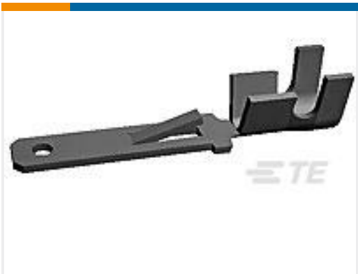
TE Part #180352-2 FF 250 TAB 4-6MM2 PTBR