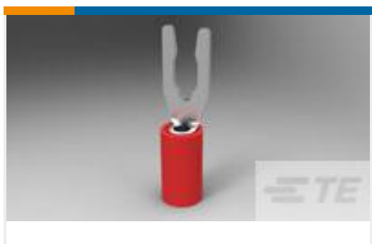
TE Part #52409 TERMINAL, PIDG SPR SPD 22-16 6