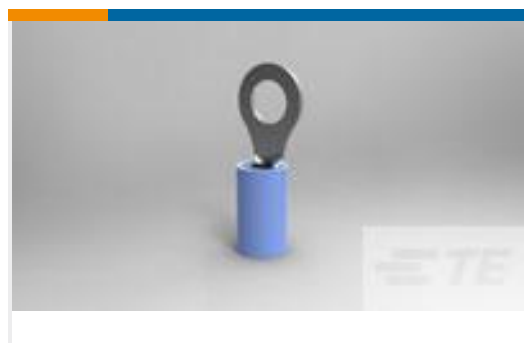
TE Part #130094 PIDG RING