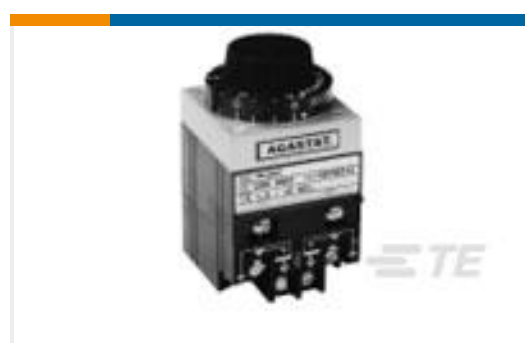
TE Part #5-1423164-6 7022WC=RLY,STD,OFF,2P,96VDC,15