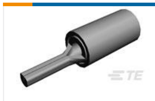
TE Part #165046 PIDG WIRE PIN