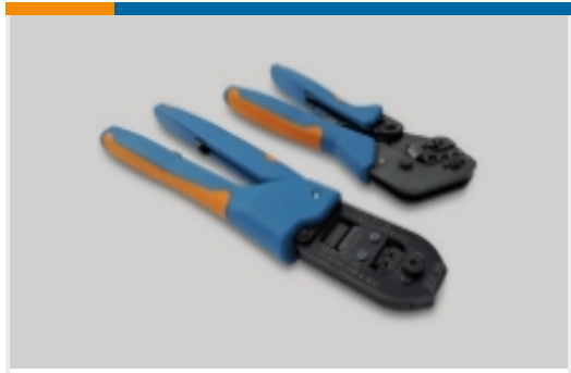
Hand Crimping Tools(2)