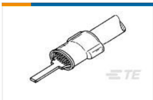
TE Part #131332 TERM, TAB, PIDG, 12-10