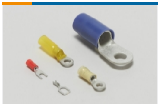
Ring Terminals & Spade Terminals(861)