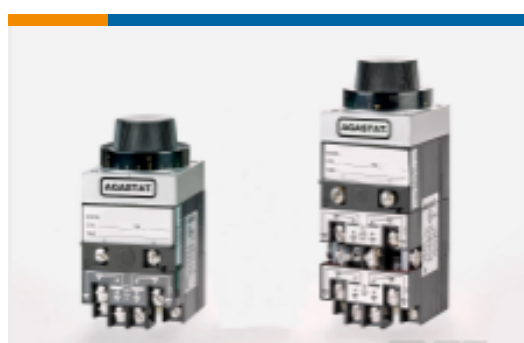
TE Part #2-1755142-6 7022WDS=RLY,STD,2P,OFF,96V,50S,S