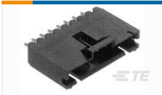
TE Part #103638-4 05 MTE HDR SRST LATCH .100CL