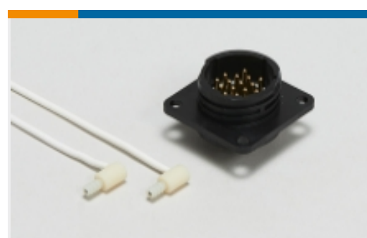
Circular Power Connectors(2)