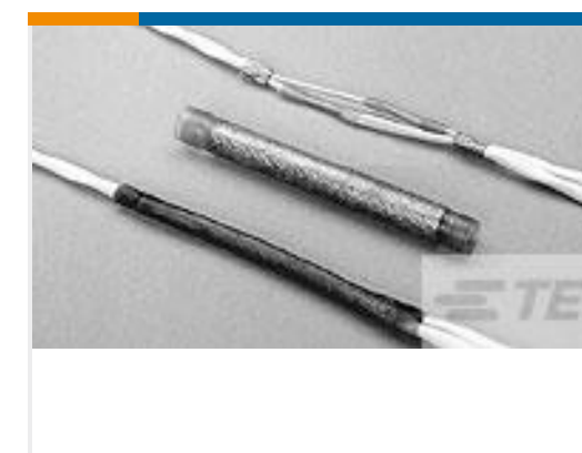
TE Part #608633-000 D-150-0232