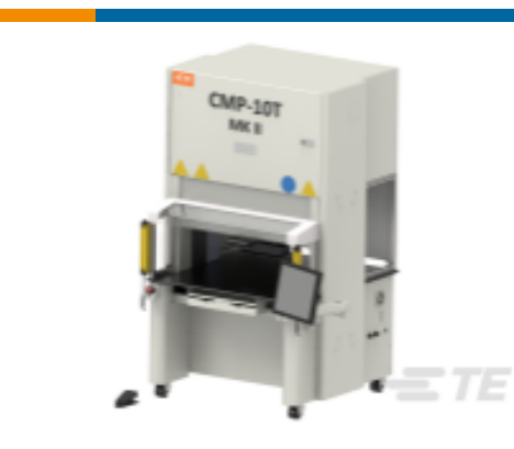
TE Part # CAT-CMP-10TMKII Connector Press Fit Machine