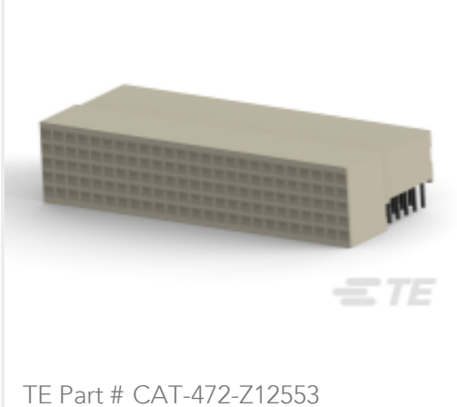
HM Receptacle Connector: Traditional Backplane, Coplanar, 2mm