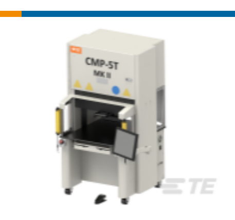
TE Part # CAT-CMP-5TMKII Connector Press Fit Machine CMP-5T MKII