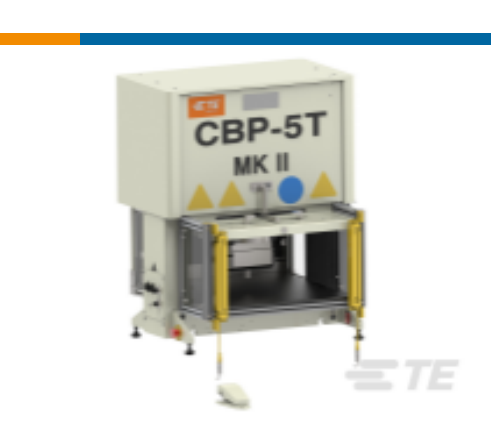
TE Part # CAT-CBP-5T CBP-5T MKII Benchtop Press - Servo Electric