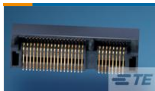
TE Part #1759503-1 mini PCI-E 8H Type I PKG G/F