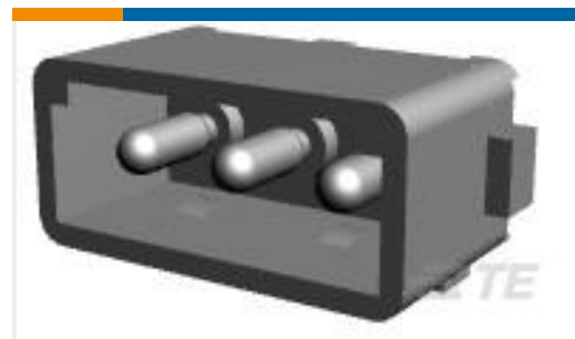
TE Part #1586514-2 03P CMNL HDR ASSY PC NATL LF