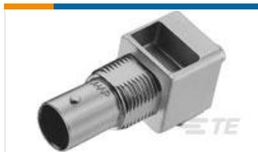
TE Part #5413879-1 JACK ASSY,RTANG,BNC