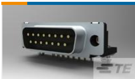
TE Part #5747841-4 15 MSFL PLUG RA 318 (IN,FM,BL)