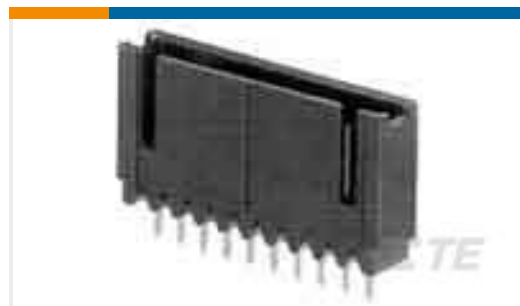
TE Part #5-102202-3 06 MODII HDR SRST SHRD LF