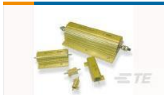
TE Part #1676625-9 HSA25 5K6 5%