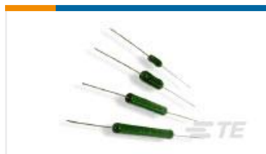
TE Part #1-1623773-0 C10 15R 5% (LOOSE)