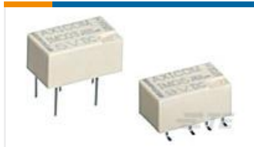
TE Part #1462042-8 IMC03GR=IM RELAY 140mW 5V 1CO