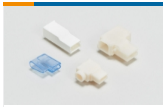
Crimp Terminal Housings(13)