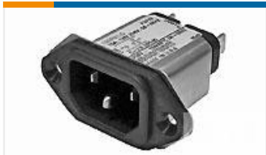
TE Part #6609987-7 15SRB1-Y=F8219F