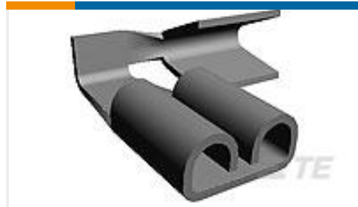
TE Part #60991-1 110 FASTON FLAG REC 22-16 AWG BR