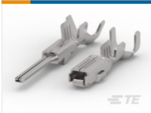
TE Part #282109-1 AMP SUPERSEAL 1.5MM, RECEPTACLE AND TAB