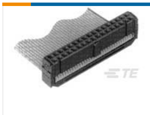
TE Part #1658622-1 10 NOVO MIL/CTR 30DP,LEAD FREE