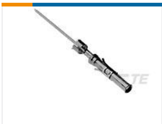
TE Part #1-66473-8 SKT,.062 DIA,.045 SQ POST,LP