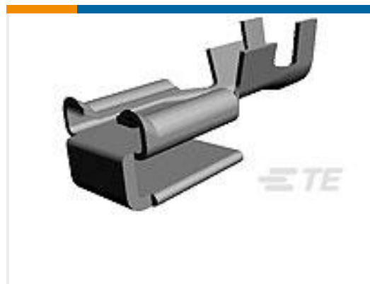
TE Part #62109-2 250 FASTON REC 18-14 AWG TPBR