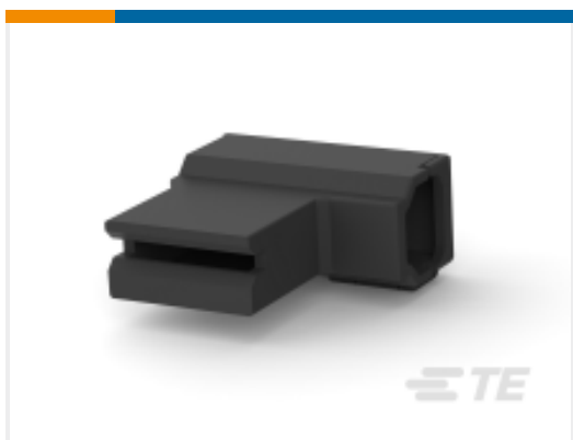
TE Part #1969657-1 250 FASTON HSG.,FLAG,REC.,1 POS, BLACK