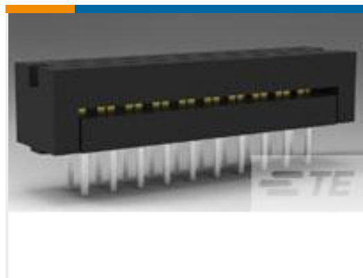
TE Part #2-746610-1 010 DIP PLUG 100CL TIN