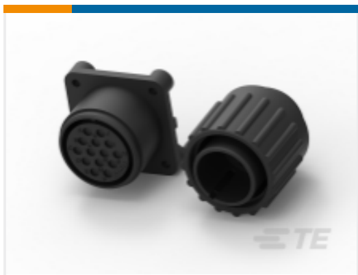
TE Part #213571-2 CPC MIL-C-5015 Connector