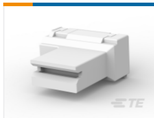
TE Part #1969656-1 250 FASTON HSG.,FLAG,REC.,1 POS, NATURAL