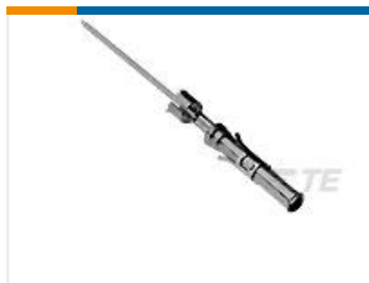
TE Part #5-66461-9 SKT,.062 DIA,.025 SQ POST,LP